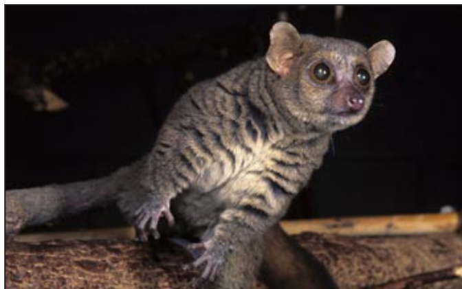
Figure 2. Mirza zaza.

Because the species is newly described and its conservation status has yet to be assessed by further research, it has been tentatively categorized as Data Deficient (Mittermeier et al. 2006). However, given that M. coquereli is currently listed as Vulnerable (VU A2c) (IUCN 2006), and that M. zaza most likely has a much smaller distribution—albeit perhaps with a higher population density—than M. coquereli , M. zaza must be considered at least as Vulnerable and could very well be Endangered. Although the species' presence in any protected areas has yet to be confirmed, M. zaza may occur in the Manongarivo Special Reserve and the Tsingy de Namoroka National Park.