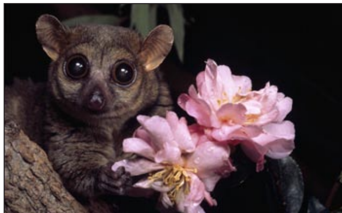
Figure 4. Mirza zaza .

and National Park, where it is replaced by M. simmonsii (Kappeler et al. 2005; Louis et al. 2006).