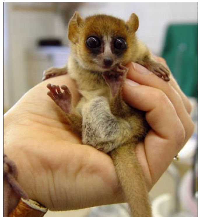
Figure 3. Microcebus lehilahytsara .

The exact distribution area for M. lehilahytsara has still to be assessed. Currently, it is known only from the type locality of Andasibe and surrounding regions (for example, Maromizaha Forest; Randrianambinina and Rasoloharijaona 2006), including the two protected areas Analamazaoatra Special Reserve and Mantadia National Park (Kappeler et al. 2005; Mittermeier et al. 2006) (Fig. 1). The extent of the distribution of this species to the south and north is still unknown. Based on currently available information, it is unlikely that Goodman's mouse lemurs occur in sympatry with other mouse lemur species. The maximum extent of its range to the south may be Ranomafana National Park, where it is replaced by M. rufus , and to the north to the Betampona Strict Nature Reserve and Zahamena Strict Nature Reserve