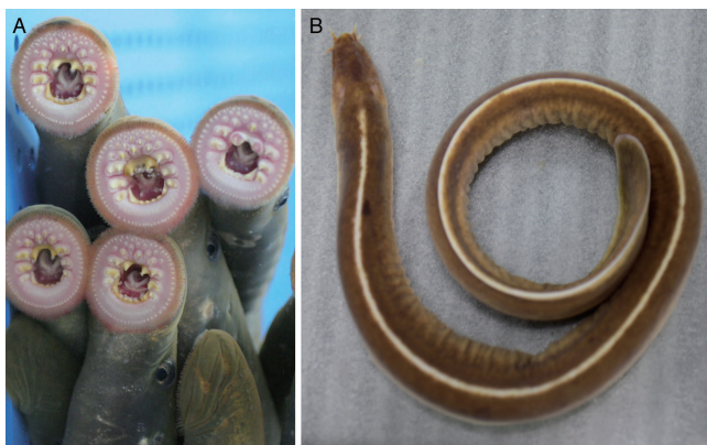
Fig. 1. The lamprey Lethenteron japonicum (A) and the hagfish Eptatretus burgeri (B).

To better elucidate the evolution and diversification of vertebrates, the basal-most lineages of extant vertebrates, namely lampreys (Fig. 1A) and hagfish (Fig. 1B), are of pivotal importance. Especially the embryology of the hagfish had long been hindered by their deep-sea habitat and difficulties in lab rearing; however, Kuratani's group demonstrated a breakthrough by obtaining the first fertilized hagfish eggs in 2007 (Ota and Kuratani, 2006; Ota et al., 2007). They have thus far published several papers on hagfish development in ZS (Ota and Kuratani, 2008; Oisi et al., 2013). Oisi and colleagues discovered that the hagfish hypobranchial muscles and the nerves innervating them exhibit a very peculiar morphological pattern, which violates a basic rule of homology shared by all the other vertebrate lineages (Oisi et al., 2015). Furthermore, Tada and Kuratani (2015) investigated the evolutionary origin of the accessory nerve and cucullaris muscles that are missing from the cyclostomes, thereby identifying them as newly added features in the vertebrate body plan to define the gnathostomes.