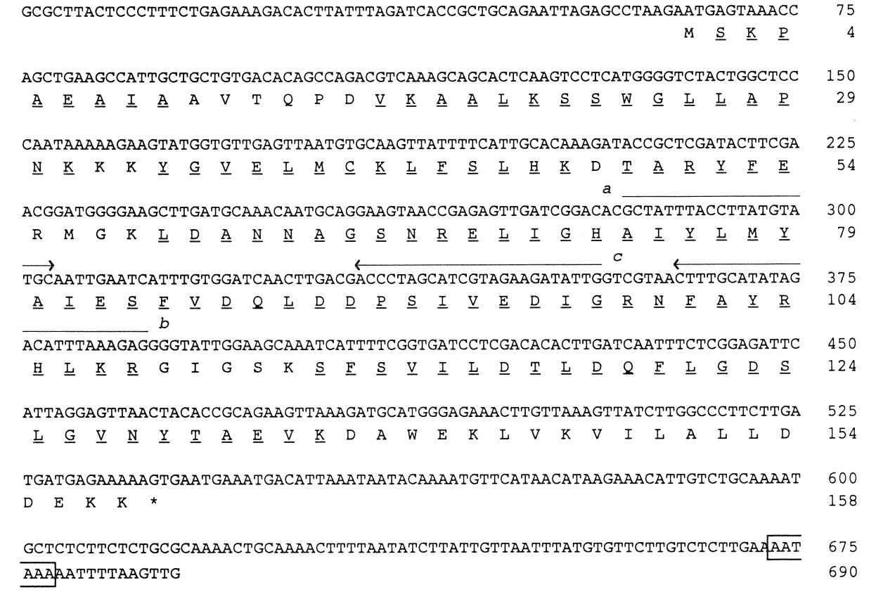
Fig. 1. Nucleotide and derived amino acid sequences of cDNA of chain II of B. virescens hemoglobin. Arrows a and b indicate the primers used in the PCR amiplification. Polyadenylation signal (AATAAA) are boxed. The amino acid residues determined by protein sequencing are underlined.

In Anadara (Scapharca) tetrameric and homodimeric hemoglobins, E and F helices are shown to participate in important inter-subunit interactions [4]. Consistent with this, three constituent chains of Anadara hemoglobins are highly-homologous especially in E and F helices: 24 out of 30 residues are identical as shown in Figure 2. The overall similarities between Anadara chains are 48–55%. If we compare the amino acid sequences of B. virescens chains I and II with that of Anadara consensus sequence [1], only 13–14 residues (underlined in Fig. 2) are conserved. Thus it is unlikely that B. virescens heterodimeric hemoglobin forms a