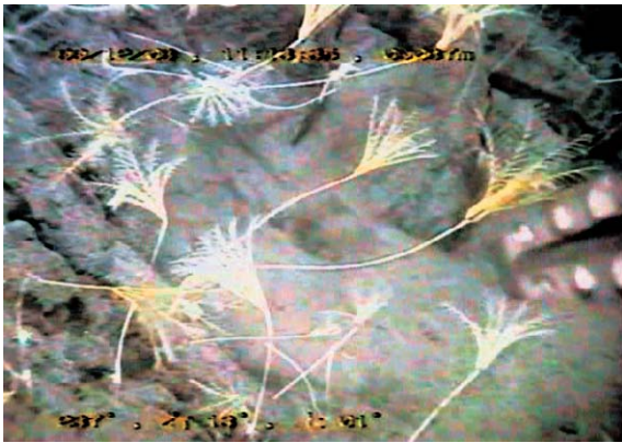
Fig. 2. Close-up view of bathycrinid crinoids from a depth of 9087 m ( Kaiko Dive 148). Note that the crinoids have possibly 10 arms, with long pinnules (appendages on the arms), and slender stalks with slight undulations on the lateral surface. At the right is a part of the manipulator of ROV Kaiko .

and there were 10 arms. Although the resolution of the video was not good, the lateral stalk surfaces of some specimens (Fig. 2) show a fine zigzag pattern (undulating, not smooth), suggestive of the synarthrial articulations characteristic of the order Bourgueticrinida (Rasmussen, 1978), a taxon common at bathyal depths. The appearance of these crinoids suggests they might represent Bathycrinus volubilis , a species previously described from Kamchatka-Kuril, Japan, and Izu-Ogasawara Trenches (Mironov, 2000).