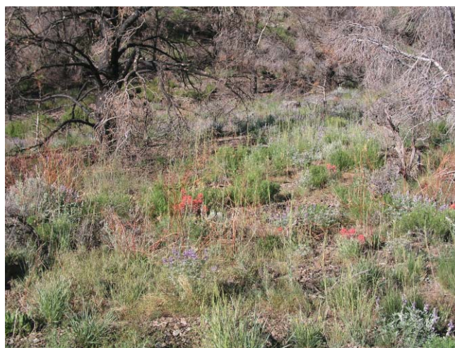
Recovery of sagebrush steppe following prescribed fire.

understanding of the effects of different management approaches, like biocontrol agents and prescribed or managed fire, is needed to effectively manage both wildfire and invasive species. For example, in pinyon–juniper ecosystems, it is necessary to identify methods for managing expansion that promote native recovery rather than conversion to an undesired state.