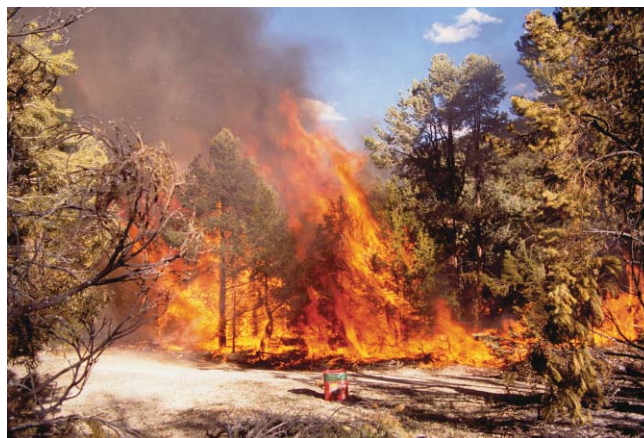
Use of prescribed fire in pinyon–juniper woodland.

The probability that a given shrubland will transition to woodlands, to nonnative annual grasses, or both is linked to three ecological concepts: ecological resistance, ecological resilience, and thresholds. 20 Ecological resistance is the degree to which a community maintains itself over time despite the introduction of invasive species. Ecological resilience describes the ability of a community to return to its predisturbance and, presumably, its pre-invasion state after a disturbance. Threshold crossings occur when a community does not return to the original state via natural processes following disturbance, but requires active management to restore the original state. 21,22 Research and management projects aimed at understanding the factors that influence ecosystem resistance to invasive species and resilience after fire and other types of disturbance are needed both to prioritize areas for restoration and other management activities, and to develop effective treatments for different types of ecosystems. 20 Defining the specific soil characteristics, vegetation composition, and abundance of different ecological types that are likely to result in recovery versus threshold crossings can be used to refine restoration and other management strategies. Further, increasing our