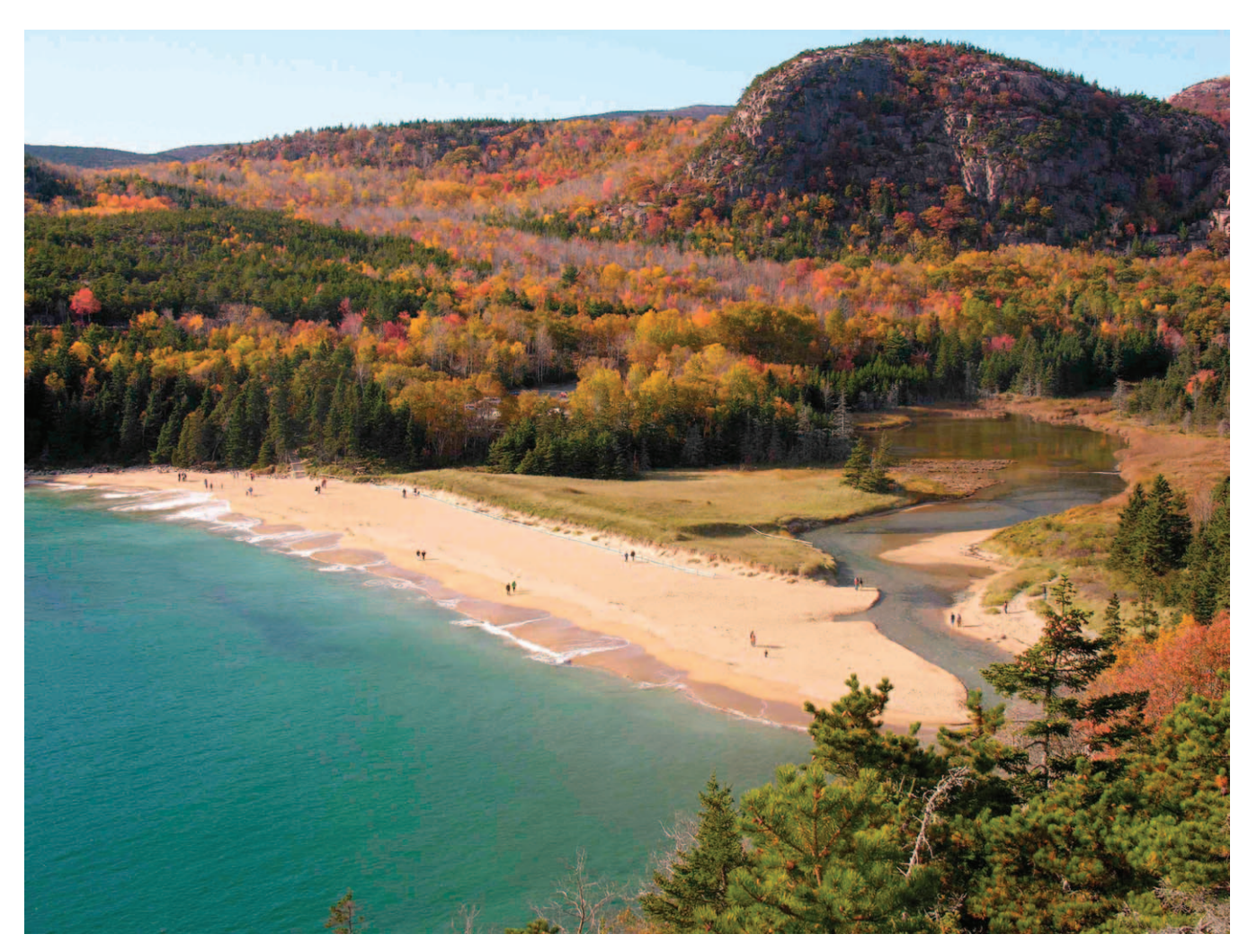
ACADIA NATIONAL PARK, MAINE, U.S.A.

This popular sandy beach is seen in the fall season with the foliage in color. Yellow leaves come from birch trees ( Betula sp.), red leaves from maples ( Acer sp.) and the green are spruce ( Picea sp.) and fir ( Abies sp.) trees. This is a youthful forest that burned in 1947. The beach is composed of cold-water carbonate sands comprised of barnacles ( Balanus sp.), blue mussels ( Mytilus edulis ) and echinoderm ( Strongylocentrotus droebachiensis ) spines. The mountain in the background is composed of Silurian granite. (Photograph taken October 2008, and caption by Joseph T. Kelley, Department of Earth Sciences, University of Maine, U.S.A.)