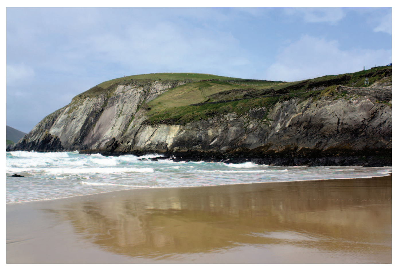
DINGLE COAST, COUNTY KERRY, IRELAND, UNITED KINGDOM

The Dingle Peninsula, in County Kerry, is the northernmost of the series of peninsulas which form Ireland's southwest coast. Underlying the mountainous spine of the Corca Dhuibhne, the Dingle Peninsula contains a stony core of rock of at least 410 million years to the Silurian Period of the Palaeozoic Era. Geologic evidence shows the presence of a shallow sea where small colonial corals, brachiopods, and trilobites lived on a soft bottom of fine sand and mud. Nearby, active volcanoes periodically blanketed the region with fine deposits of volcanic ash and an occasional lava flow.