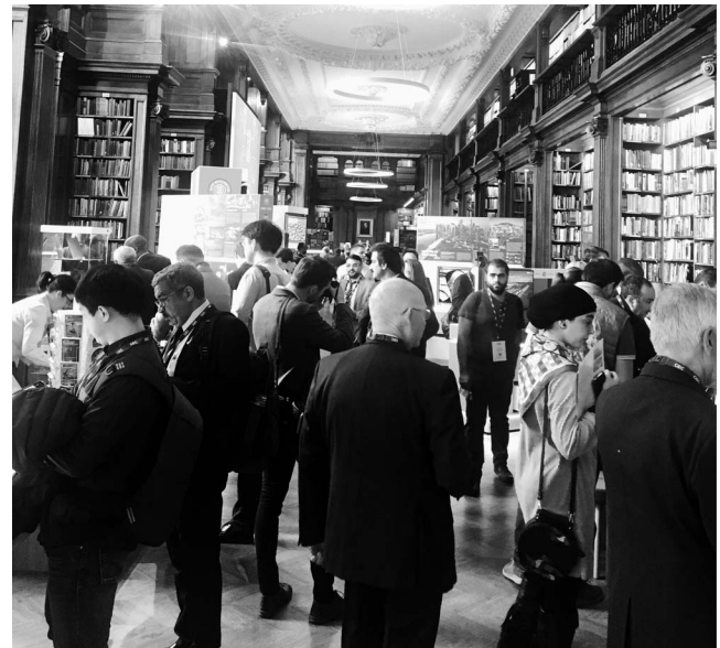
Figure 2. Congress attendants mingling and discussing insights during a breakout session.

Day 4 of the congress delved into the subject of engineering and its social impact. To this end, a joint statement of intent to take action on climate change was signed that morning by ICE, the American Society of Civil Engineers, and the Canadian Society for Civil Engineering (CSCE) outlining the three organisations' intentions to raise the standards of civil