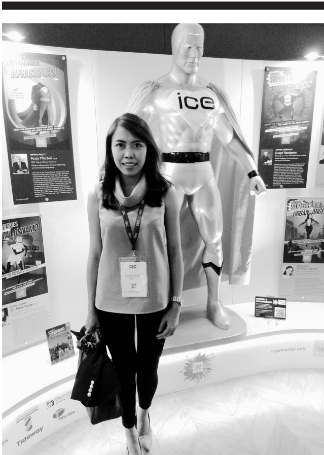
Figure 3. Congress attendant visiting the Invisible Superheroes exhibition.