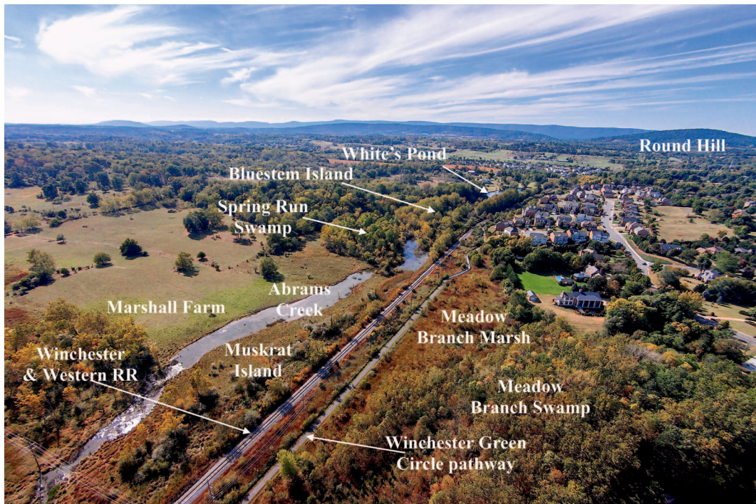
Figure 1. Abrams Creek Wetlands, adjacent land uses, and physiographic setting looking west across the Shenandoah Valley to the Allegheny Mountains. Boundary between Frederick County (left) and Winchester City (right) follows the railroad tracks. Headwaters of Abrams Creek are on Round Hill.

(Davis 2003; Mangino 2003a, 2003b; Gomes 2014).