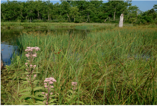
Figure 3. Muck fen (MF) habitat type on the edges of Muskrat Island (foreground) and Marshall Farm (background). Dominated by mixed graminoids; Eutrochium maculatum var. maculatum in foreground.