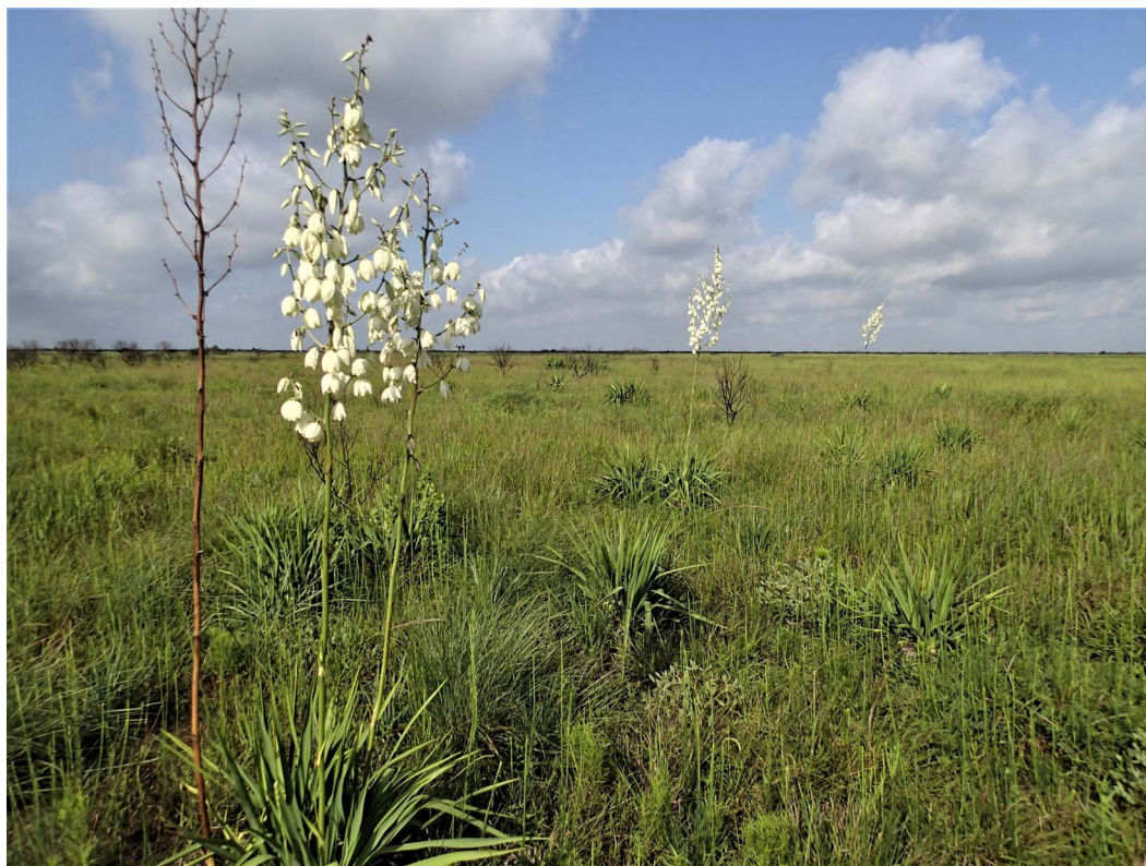
FIG. 3. Habit. Yucca carriei population, Brazoria National Wildlife Refuge.

Benth., Sambucus sp., Verbena stricta Vent., Hibiscus laevis All., Rubus sp., Ibervillea sp., Passiflora incarnata L., Vitis mustangensis Buckley, Campsis radicans (L.) Seem. ex Bureau, Borrhchia sp., Cuscuta sp., Cissus sp., Spartina spartinae (Trin.) Merr. ex Hitchc., Schoenoplectus americanus (Pers.) Volkart ex Schinz & R. Keller, Phragmites sp., Sorghum halepense (L.) Pers., Elymus canadensis L., Chloris sp.