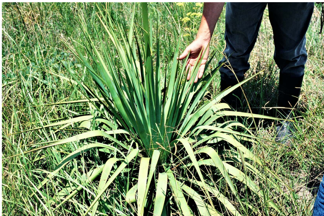
FIG. 4. Leaf rosette (Clary 432) [TEX-LL]. Chocolate Bayou, Brazoria National Wildlife Refuge.

Y. treculeana (iNaturalist obs. 24312828 and 221194239), near Mad Island WMA, Matagorda Co., the southern end of the range of Y. carrii .