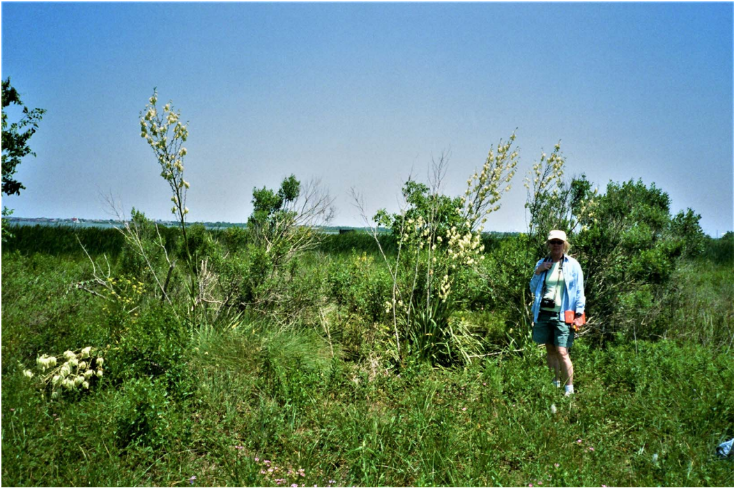
FIG. 2. Yucca carriei type locality. (Clary 427 [TEX-LL]). Texas Nature Conservancy (TNC) Texas City Prairie Preserve.

Galveston, scattered around San Leon on the north side of Dickinson Bayou (about 30 plants total), along the Texas City sea wall and the TNC Texas City Prairie Preserve (about 40 plants total; Fig. 2); Chambers, on the banks of Cotton Lake (about 10 plants); Brazoria, on the south side of Chocolate Bayou (about 50-100 plants), Brazoria National Wildlife Refuge (BNWR) (Fig. 3). Plants have been identified by photograph in Harris Co., the San Jacinto Battleground State Historic Site (Eric Keith), and Brazoria, Galveston and Matagorda counties (iNaturalist.org, https://www.inaturalist.org ). Limited surveys on existing roads have been undertaken to find more populations in similar habitat along the coast in Galveston (Galveston Bay, Galveston Island) and surrounding Chambers (Anahuac National Wildlife Refuge), Harris and Matagorda (San Bernard National Wildlife Refuge, Big Boggy National Wildlife Refuge) counties, but none have been found.