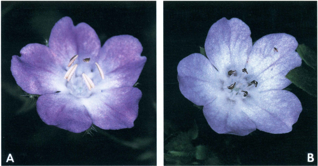
FIG. 1. Ventral views of corollas of N. sayersensis and Nemophila phacelioides . A. N. Nemophila sayersensis , B. N. phacelioides .

these are biologically distinct entities, each worthy of species status.