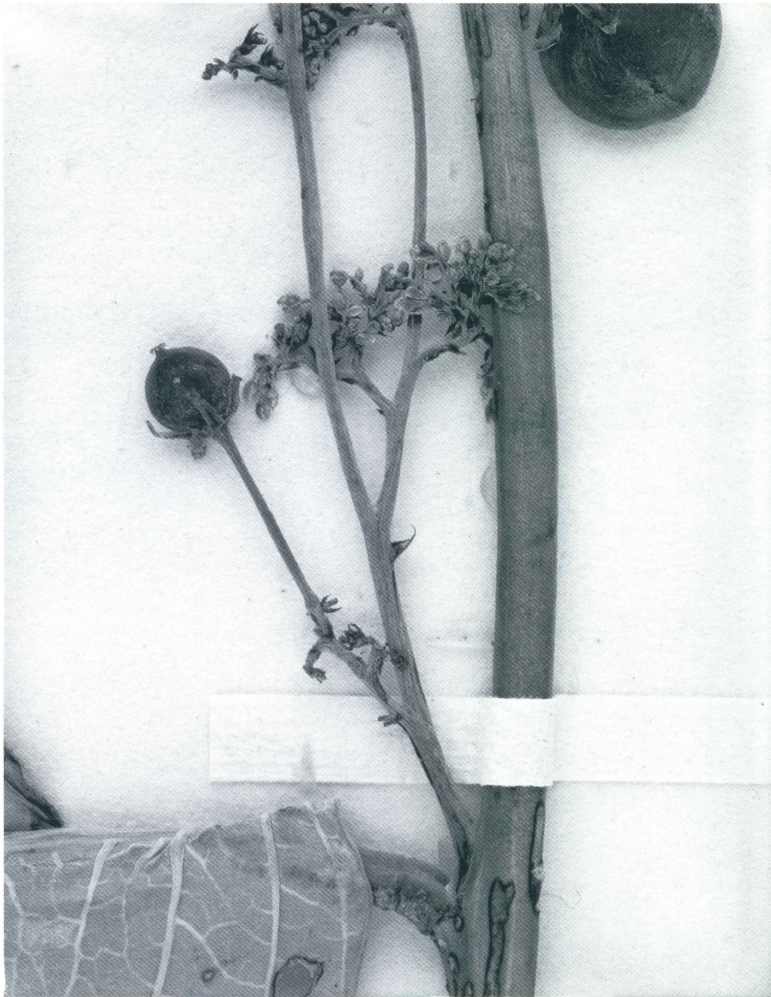
FIG. 3. Close up of bisexual glomerules with a central pistillate pedicel and paired dichasia of Phyllanthus grandifolius (Webster et al. 11268, DAV). \times 2 .

DISTRIBUTION AND HABITAT: The species is known only from the type collection, which lacks data except for the indication that it is from Colombia. In the enumeration of Mutis specimens of Blanco y Fernández de Caleyá (1991), Mutis 1902 is not listed, but localities of Mutis collections overall are summarized (in addition to the Bogotá area) as including Tolima (cabecera Mariquita) and Chocó, as well as collections in Ecuador by Caldas.