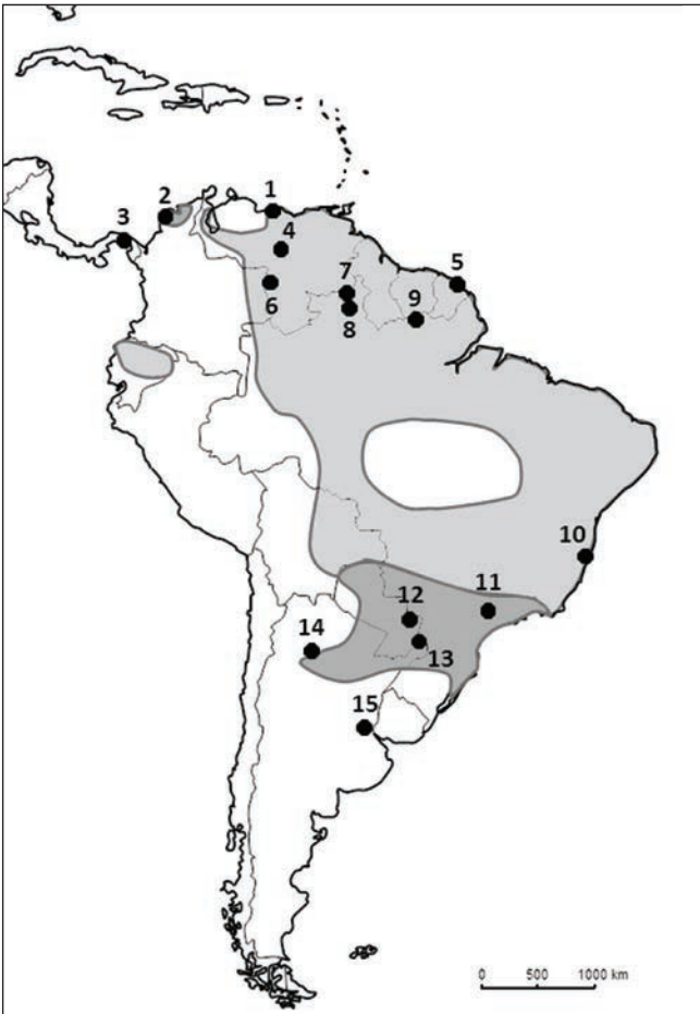
Figure 5. Distribution and breeding records of Pearly-breasted Cuckoo Coccyzus euleri . Dark grey = breeding area; pale grey = non-breeding area (after Erritzøe et al. 2012). Dots = breeding records. See Table 1.

All 15 known breeding records are summarised in Table 1 and mapped in Fig. 5. Most reports were inferred from the body condition of specimens. However, a male collected at Chajuraña, Bolívar, in August 1942 (mentioned by Payne 2005) was in fact an immature male without signs of breeding (Colección Ornitológica Phelps, COP 19552; M. Lentino