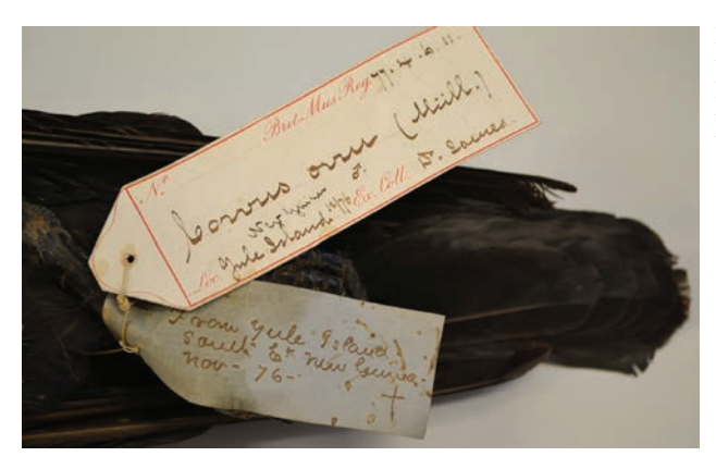
Figure 1. Torresian Crow Corvus orru with a British Museum label and original label in Dr James' handwriting

subspecies has been tentatively listed as the Papuan Trumpet Manucode in the BirdLife Australia subspecies list. It is listed because it occurs in the Torres Strait Islands, but other subspecies of Trumpet Manucode occur on mainland of New Guinea so this name appears inappropriate. Instead, I suggest the common name Dr James' Trumpet Manucode be adopted in Australia for this taxon.