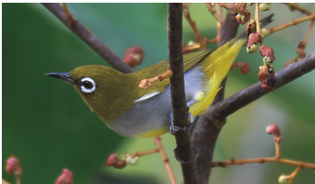
Figure 2. Zosterops 'tahanensis' , Keledang Sayong Forest Reserve, inland Perak state, Peninsular Malaysia; differs from nominate auriventer (which is unknown in life) only by average measurements (see Wells 2017, this issue)