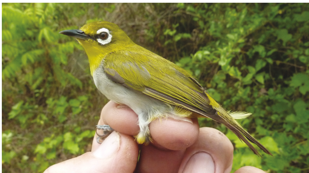
Figure 1. Zosterops (palpebrosus) 'auriventer' (= erwini ), mangrove zone, Khlong Thom district, Krabi Province, peninsular Thailand, i.e., at the proven end-point of erwini range closest to the type locality of nominate auriventer