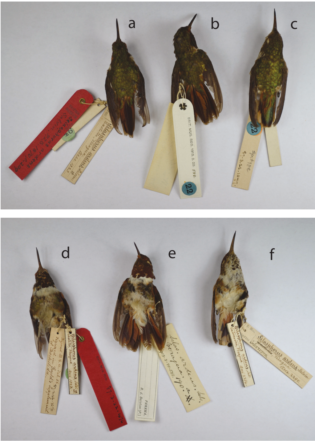
Figure 2. Specimens of Glow-throated Hummingbird Selasphorus ardens at Tring museum: (a) NHMUK 1887.3.22.1076 dorsal, syntype; (b) NHMUK 1913.3.20.588 dorsal; (c) NHMUK 1887.3.22.1077 dorsal, syntype; (d) NHMUK 1887.3.22.1076 ventral, syntype; (e) NHMUK 1913.3.20.588 ventral; and (f) NHMUK 1887.3.22.1077 ventral, syntype