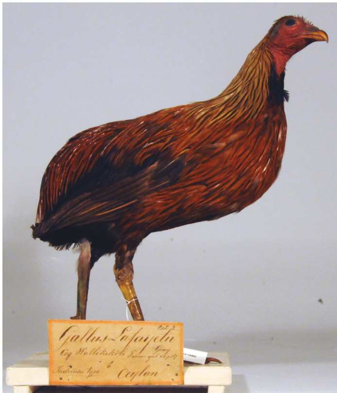
Figure 4. Second syntype of Gallus ecaudatus Temminck, 1807 (RMNH.AVES.224889), juvenile, from Temminck's former private collection (Naturalis Biodiversity Center, Leiden)

The entry is bilingual, Latin and French. Therefore, both 'primus' and 'Espèce primitive' have the same meaning and suggest that Temminck thought these birds represented the ancestral type of rumpless domestic fowl. Temminck referred ('pl. Enl.') to a lithograph of one of the birds that he intended to add to a planned series of descriptions of pigeons and Galliformes; this was never published, but is preserved among his papers in the Naturalis Library, Leiden (Fig. 2).