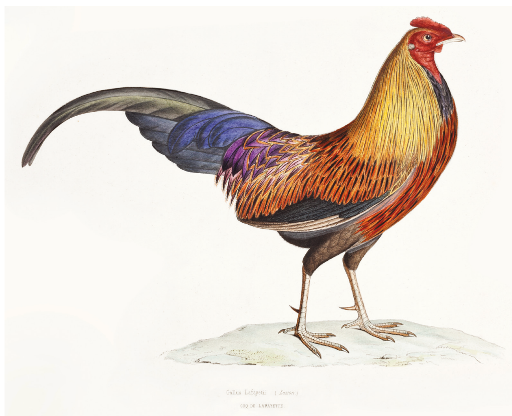
Figure 6. Oeillet Des Murs, Iconographie ornithologique (1845–49), pl. 18: ‘ Gallus lafayetii (Lesson) Coq de Lafayette’

is considered a lapsus (ICZN 1999, Art. 32.5.1) and the corrected spelling G. lafayettii is in common use (McGowan et al. 2017).