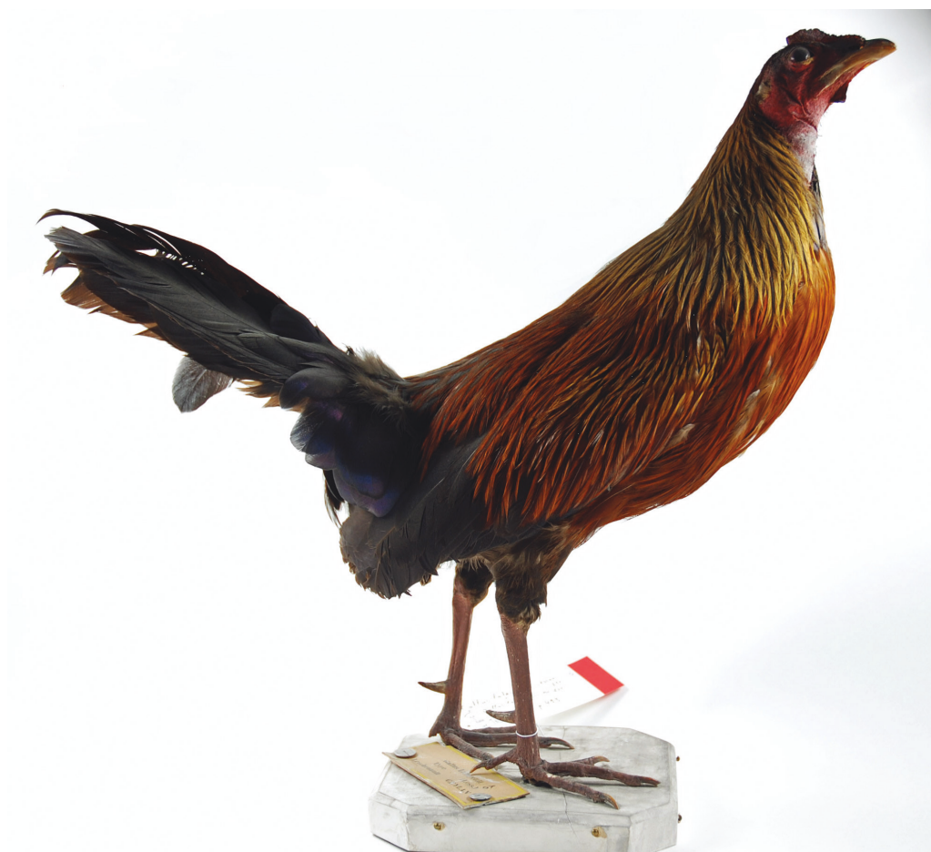
Figure 5. Holotype of Gallus lafayetii Lesson, 1831 (MNHN 2014-393) collected by Leschenault in Ceylon between July 1820 and February 1821 (Muséum national d'Histoire naturelle, Paris)

' Gallus ecaudatus , le Coq sans queue' was bought by 'RM', abbreviation of 'Rijks Museum' (RMNH) in Leiden (Raye 1827). However, Raye's specimen of G. ecaudatus is no longer present in Leiden and could have been exchanged, sold or destroyed during the intervening 190 years; its current whereabouts are unknown.