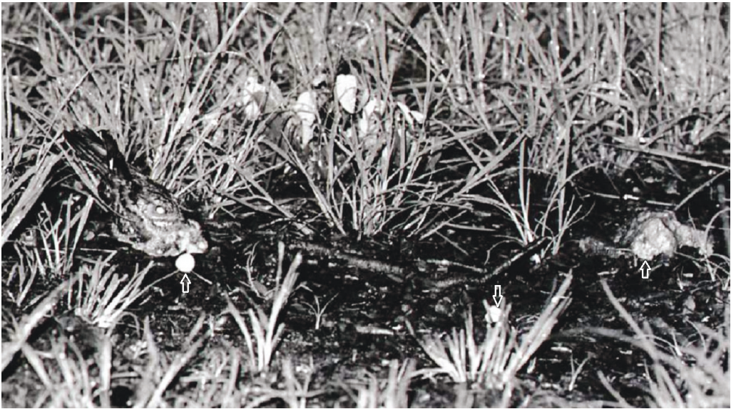
Figure 1. Three pieces of abandoned eggshell (arrowed), the largest immediately in front of the adult Fiery-necked Nightjar Caprimulgus pectoralis tending the chicks on day 1 at Muneni, a smaller piece in the lower centre and a very small piece in front of the stones to the right (H. D. Jackson)

Egg tooth. —Once a chick had hatched, it no longer needed the small straw-coloured or off-white egg tooth on the tip of the maxilla, used for cutting its way out of the shell, and so could shed it immediately. The chicks at Atlantica had shed their egg teeth by day 5 and those at Muneni by day 6, so it is remarkable that at Retreat egg teeth were still visible on both chicks on day 12 and persisted on chick 1 until day 15.