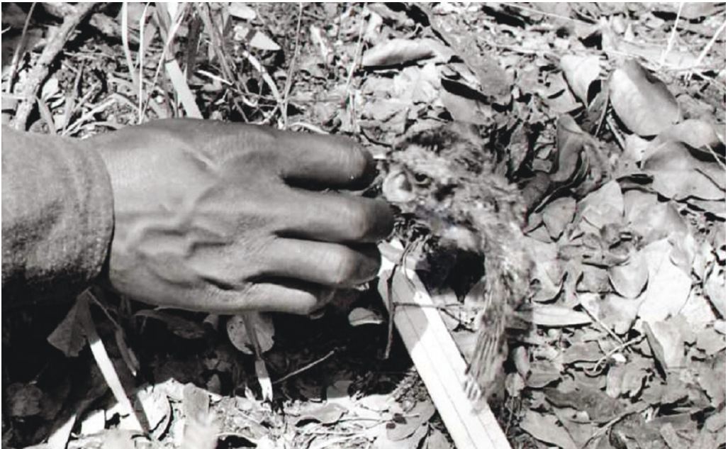
Figure 7. An approaching hand at Muneni on day 12 at 11.10 h caused Fiery-necked Nightjar Caprimulgus pectoralis chick 2 to lunge aggressively at the fingers, with wings spread and gape wide open, while hissing

brooded. The brooding female typically waited for the male to arrive with the first feed of the evening before departing to hunt. At Ranelia on day 1 at 18.15 h, when the male arrived