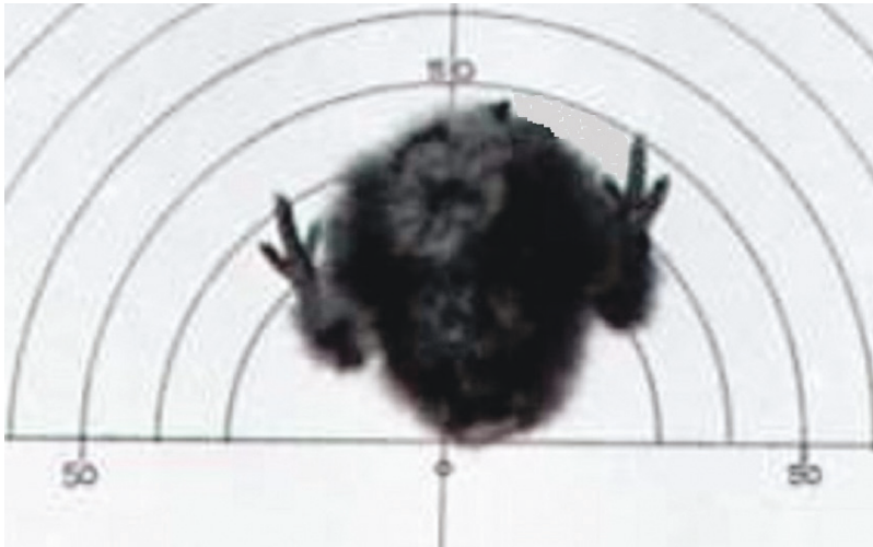
Figure 2. Fiery-necked Nightjar Caprimulgus pectoralis chick 2 on day 4 at Muneni, showing the well-developed legs

apparently dropping the eggshell somewhere, for she had returned within a few seconds, minus the eggshell, landing next to the chick before brooding it.