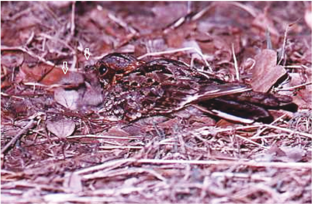
Figure 4. Male Fiery-necked Nightjar Caprimulgus pectoralis at Ranelia feeding chicks (arrowed) at 18.40 h on day 6; the chick on the left has been fed and is settled, while that on the right is stretching up to grasp the male's bill to provide the feeding stimulus (H. D. Jackson)

food by seizing their bills, but with no food forthcoming crawled underneath the adult again. Males arrived with the first feed at c.18.30 h and the females departed to go hunting; they then took turns to tend the chicks, and while one adult was away hunting the other was usually feeding or brooding the chicks. Sitting birds occasionally took off vertically to capture a flying insect, and sometimes the chicks were left alone, but they started calling after a few minutes and this brought a parent back.