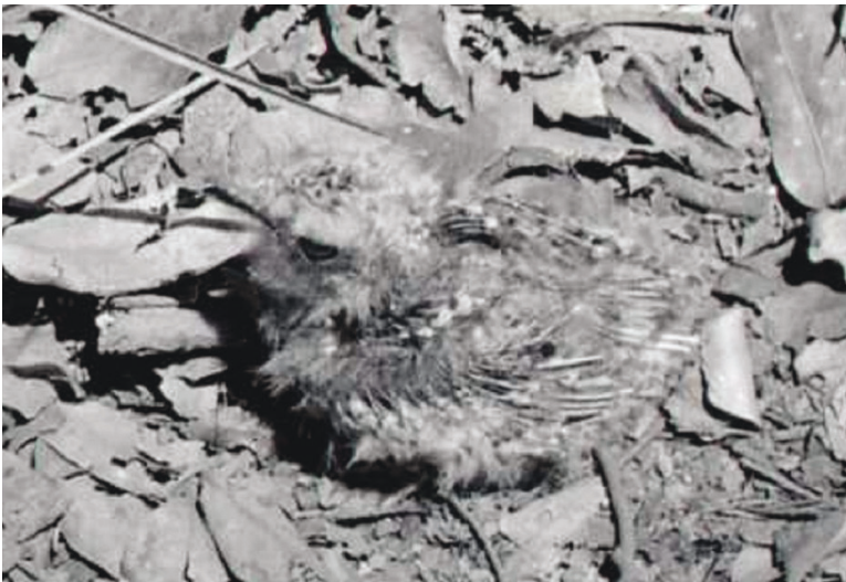
Figure 10. Fiery-necked Nightjar Caprimulgus pectoralis chick 2 at Muneni on day 10, showing the growth of the flight feathers (H. D. Jackson)

During distraction displays the birds maintained a bold upright stance, standing and rocking sideways, sometimes even bouncing up and down as much as 5 cm, especially when perched on a branch. The eyes were wide open, the head held upright, the breast off the ground and the plumage raised. The tail and both wings were usually spread fully, but sometimes just one wing was spread. The chuck call was regularly used to warn the chicks to remain immobile. When being approached, the perched birds often bobbed their heads. After day 18, when the chicks were able to fly, the adults no longer performed distraction displays, but instead flew towards me and hovered nearby.