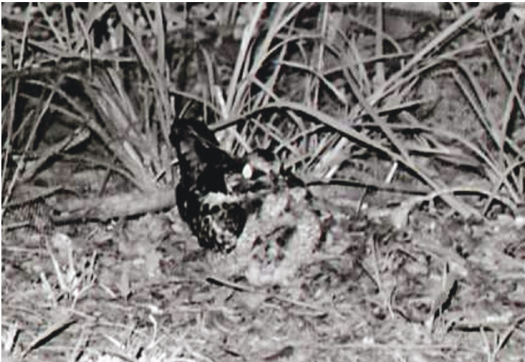
Figure 9. On day 6 at Muneni the fence shown in the background prevented the Fiery-necked Nightjar Caprimulgus pectoralis chicks from reaching the adult; as soon as the adult flipped over the fence the chicks ran across to be fed