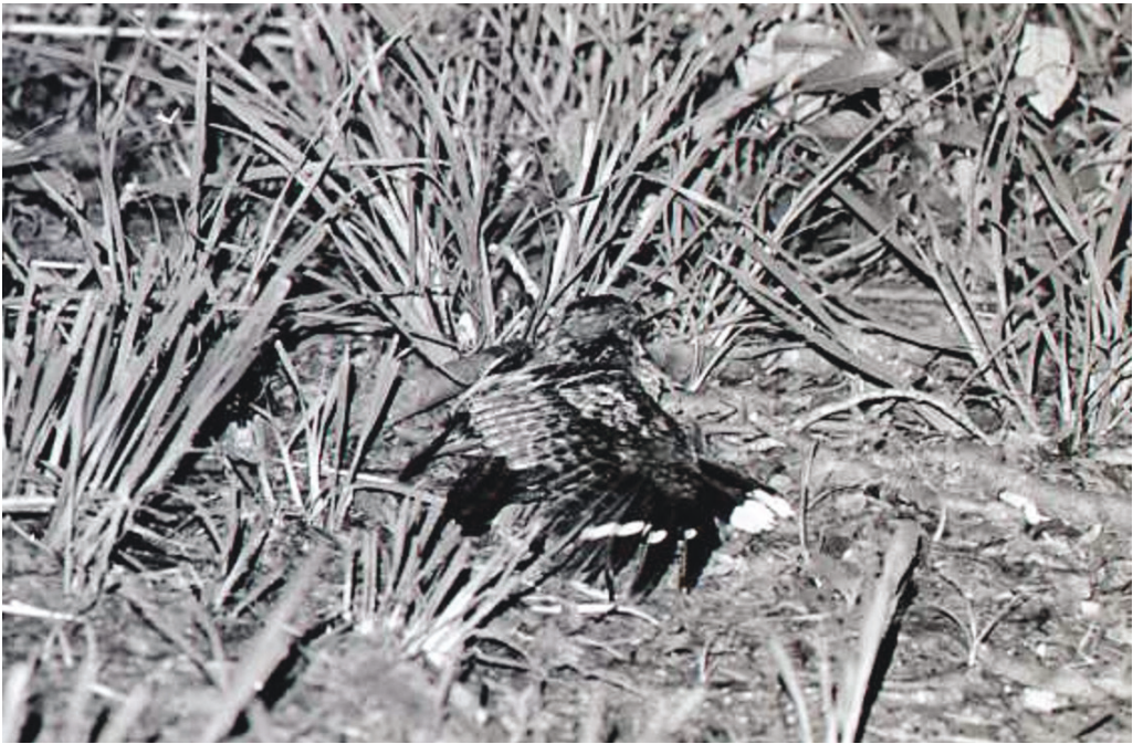
Figure 5. While brooding at night, the male Fiery-necked Nightjar Caprimulgus pectoralis at Muneni stretched its right wing and spread its tail after rocking from side to side (H. D. Jackson)

soon started gular fluttering again. The body temperature of chick 2 at Muneni was taken daily between 11.00 h and noon from day 3 to day 16 just after the female had flushed. This ranged from 39.2–40.6°C (mean 39.6°C), but rose as high as 42.6°C if the chick had been handled or had exerted itself.