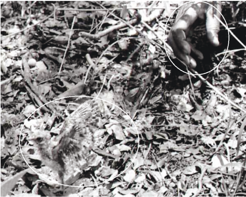
Figure 8. Further provocation of the Muneni Fiery-necked Nightjar chick 2 (circled upper right) on day 12 at 11.25 h caused it to run away with wings held up (circled lower left)

and fed the chicks for the first time, he then, while brooding, showed great interest in flying insects silhouetted against the moon. At no stage did he take off after an insect, or even give a flight intention movement, but his head swung from side to side and occasionally arced up and over slowly as he followed an insect. While brooding the chicks at Muneni, the male made some wing and tail stretches after rocking from side to side (Fig. 5).