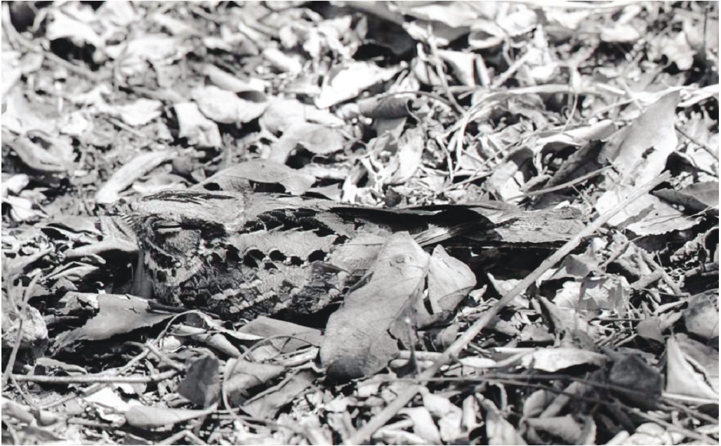
Figure 6. Cryptic posture adopted by female Fiery-necked Nightjars Caprimulgus pectoralis by day when they felt threatened, flattening the body into the substrate as far as possible, closing the eyes to a slit, sleeking the plumage and remaining immobile (H. D. Jackson)