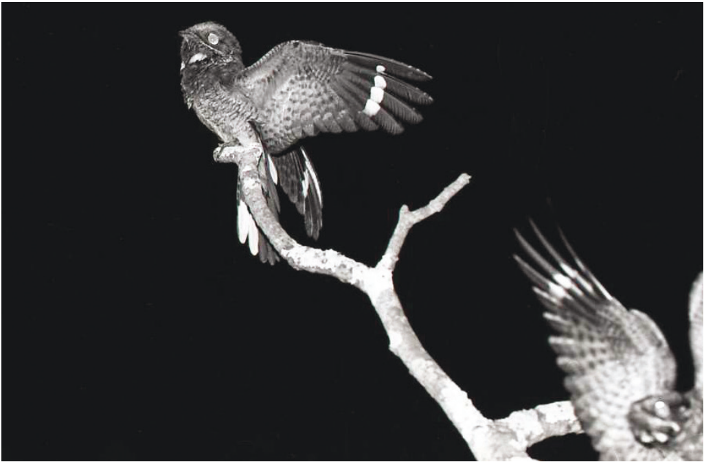
Fig. 3. Male Fiery-necked Nightjar Caprimulgus pectoralis at Muneni singing from an elevated perch while a female flies around, during the courtship stage (H. D. Jackson)

The microphone near the Atlantica nest sometimes detected quiet sounds that were inaudible to me in the hide <3 m away. For example, on day 14 at c.22.00 h the chicks were being brooded by an adult and were very restless. Through headphones I could hear them tittering continuously, and the adult soothing them with quiet 'wooting'. Without the headphones I could hear none of this. As the chicks grew older their cheeping grew deeper and could better be described as chirping, which they not only uttered from the ground, but also in flight. On day 16 at 11.50 h the remaining Muneni chick called 120 times at fairly regular intervals of 1.0–1.5 seconds, while looking around with its eyes three-quarters open and rocking from side to side. The calling was not loud, but was huskier and deeper than previously.