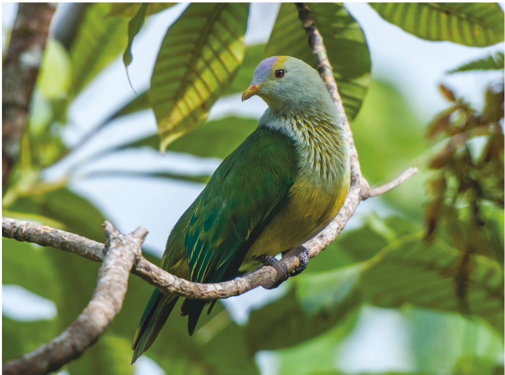
Figure 4. Leeward Society Islands Fruit Dove Ptilinopus chrysogaster

un jaune-serin sur la gorge, et un jaune vif sur le ventre et sur les couvertures inférieures de la queue. Une calotte, d'un violet tendre que borde un auréole jaune, couvre la tête de la manière la plus gracieuse; les rémiges sont œillées de blanc à leur extrémité, le bec est jaunâtre, et les pieds sont oranges. L'ouba a huit pouces de longueur totale.'