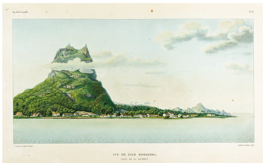
Figure 2. Bora Bora where the La Coquille stayed from 25 May to 9 June 1823. 'Vue de l'île Borabora'. Engraving by Tardieu, after Lejeune and Chazal. Pl. 16 in Voyage autour du monde, exécuté par ordre du Roi, sur la corvette La Coquille , etc. Atlas histoire du voyage, 1828

on Maupiti but has not been recorded there since 1973 and is now considered locally extinct (Thibault & Cibois 2017). P. chrysogaster was named by Gray but he was unclear as to its provenance, suggesting incorrectly 'Hab. – ? Probably from Otaheiti' (Gray 1853: 48; Fig. 1).