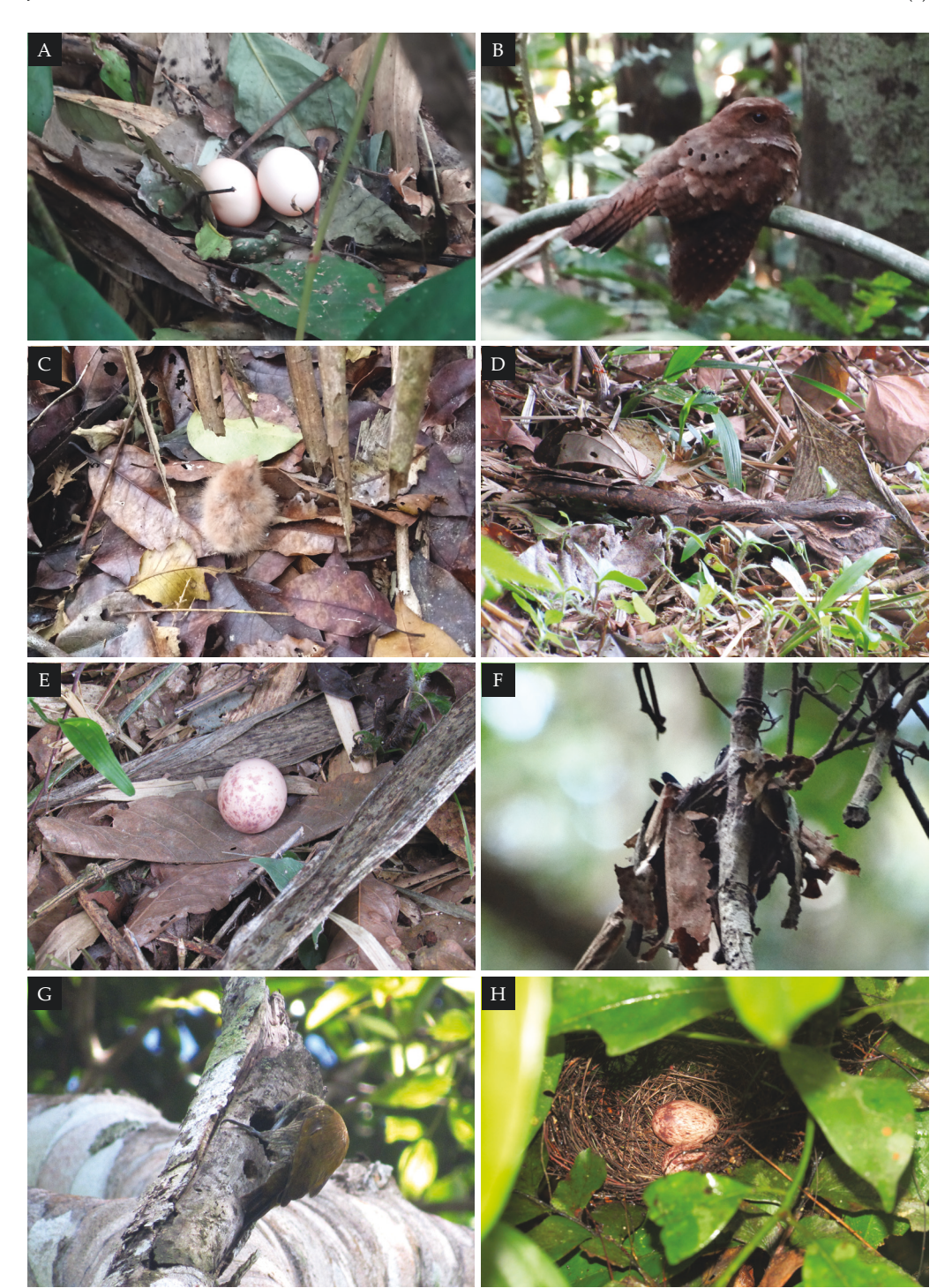
Figure 1. Breeding records of birds in Humaitá Forest Reserve, Porto Acre, Acre state, south-west Amazonian Brazil: (A) eggs of Ruddy Quail-dove Geotrygon montana ; (B–C) female Ocellated Poorwill Nyctiphrynus ocellatus and nestling; (D–E) adult Pauraque Nyctidromus albicollis and egg; (F) female Blue-tailed Emerald Chlorostilbon mellisugus on nest; (G) female Little Woodpecker Veniliornis passerinus nestbuilding; and (H) nest and eggs of Plain-throated Antwren Isleria hauxwelli

© 2019 The Authors; This is an open-access article distributed under the terms of the Creative Commons Attribution-NonCommercial Licence, which permits unrestricted use, distribution, and reproduction in any medium, propided the oxiginal author and source of