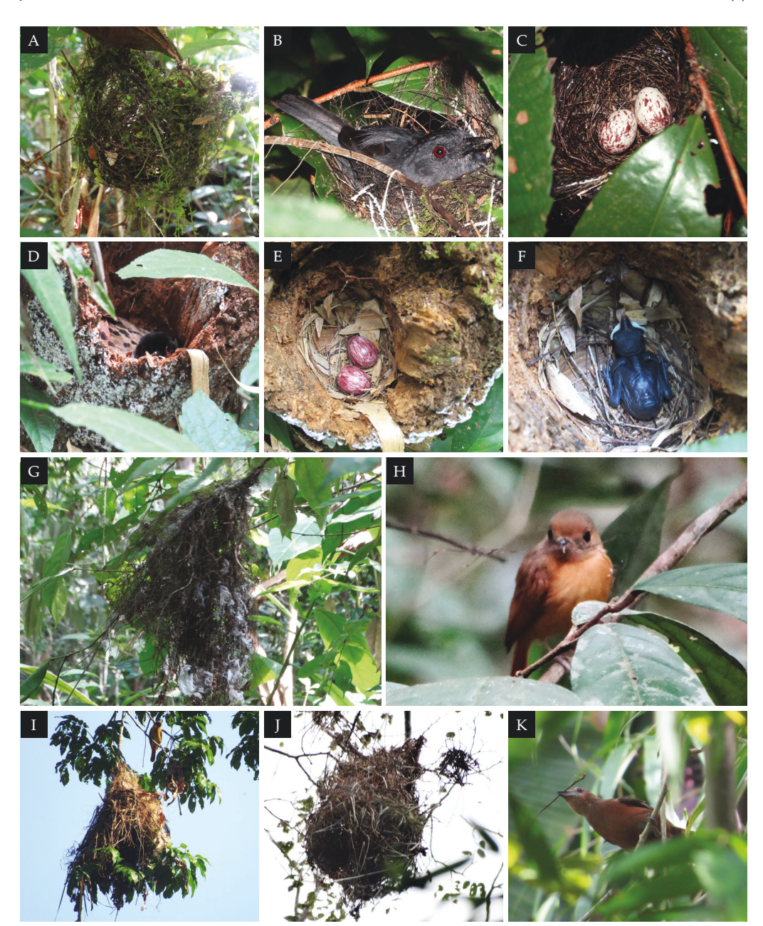
Figure 2. Breeding records of birds in Humaitá Forest Reserve, Porto Acre, Acre state, south-west Amazonian Brazil: (A-C) nest, male and eggs of White-shouldered Antshrike Thamnophilus aethiops; (D-F) nest, eggs and nestling of Black-spotted Bare-eye Phlegopsis nigromaculata; (G-H) nest of Ruddy-tailed Flycatcher Terenotriccus erythrurus and adult carrying nesting material; (I) female Pink-throated Becard Pachyramphus minor perched above nest; (J) nest of Olive Oropendola Psarocolius bifasciatus; (K) female Silver-beaked Tanager Ramphocelus carbo with nesting material

but also in the Atlantic Forest and Panama (Skutch 1984, Raine 2007, Zyskowski 2008, Silva & Carmo 2015).