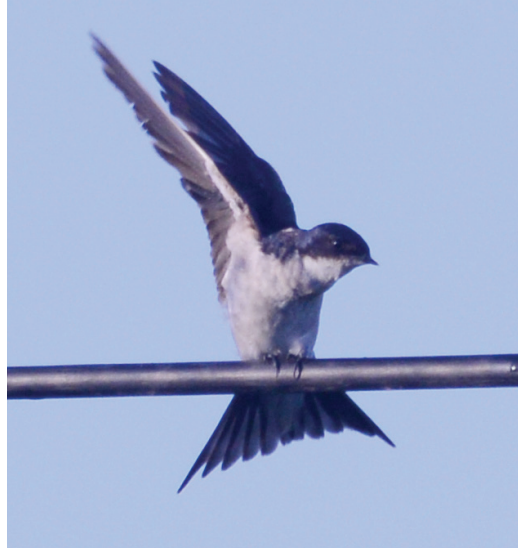
Figure 4. Pearl-breasted Swallow Hirundo dimidiata , Macaneta, Mozambique, 19 May 2019; the first documented record for Mozambique

In addition, there is a sighting of two at Pafuri, just 200 m inside Mozambique, on 31 March 2017 (A. Hogue & H. Stevens in litt. 2017; https://ebird.org/checklist/S37103572) and four at Massinghir Dam, near Limpopo National Park, on 8 August 2018 (K. Coetzer