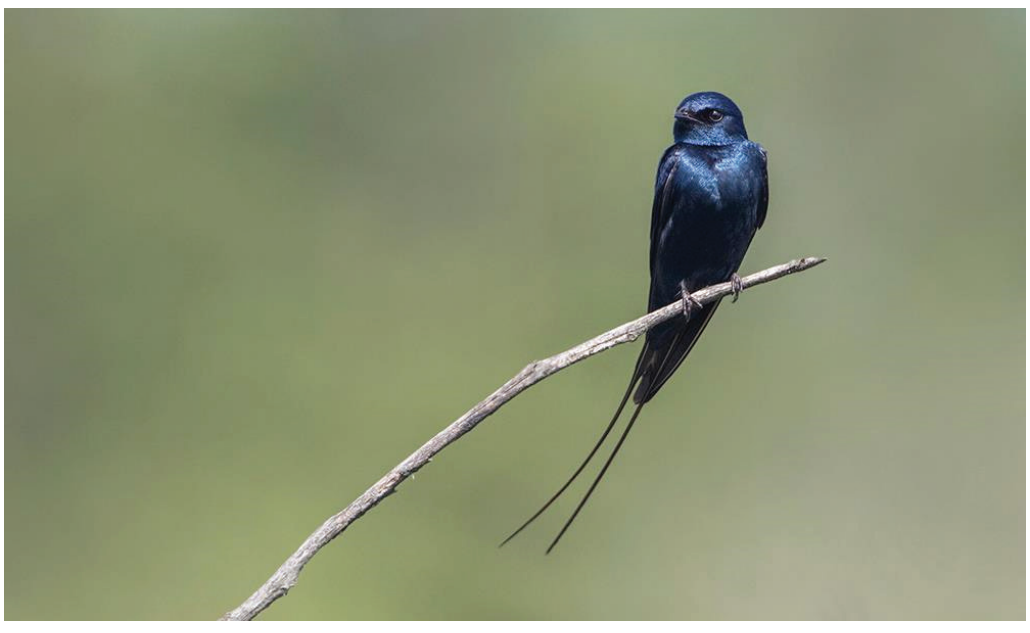
Figure 1. Blue Swallow Hirundo atrocaerulea, Mount Tsetserra, Manhica province, Mozambique, 12 December 2017; one of a pair prospecting a potential nest site at this location

In the southern African subregion the breeding range extends from the KwaZulu-Natal Midlands north through Mpumalanga, Eswatini and the eastern highlands of Zimbabwe