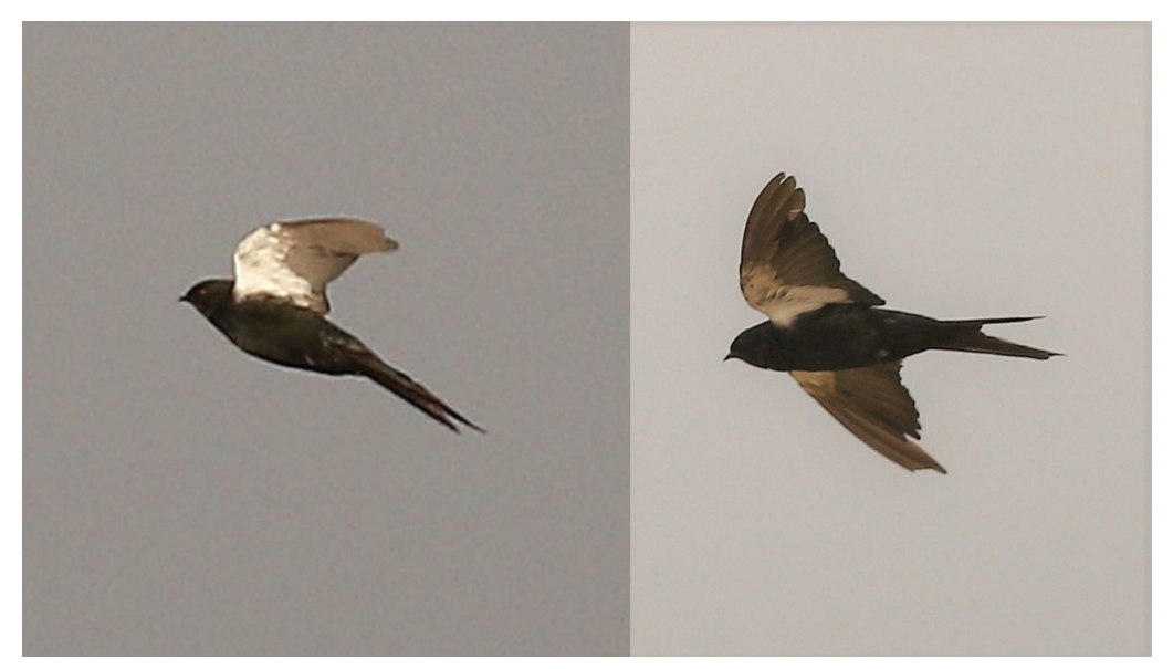
Figure 2. Eastern Saw-wing Psalidoprocne orientalis percivali, Phinda Private Game Reserve, KwaZulu-Natal, South Africa, 8 October 2016; note distinctive white underwing-coverts. The first record of this subspecies for South Africa

Records from the SABAP2 database (http://sabap2.birdmap.africa/) show P. o. percivali to be more frequent within its known range during the austral summer (November–March) while the extent of its non-breeding grounds is not certainly known, although speculated to be in Mozambique (Irwin 1981, Harrison et al. 1997). Clancey et al. (1969) reported it at Inhaminga in June–July with many other aerial feeders (including Mascarene Martin; see below), one of the few non-breeding season records of this subspecies (Hockey et al. 2005).