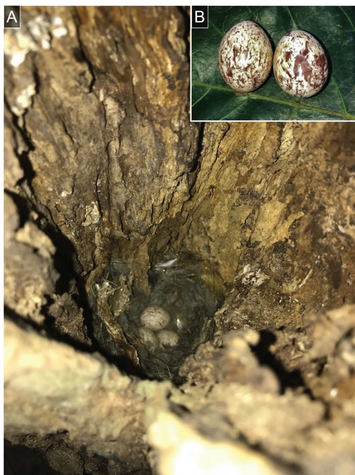
Figure 2. (A) Internal view of a Rufous Casiornis Casiornis rufus nest; (B) eggs of C. rufus from another nest.

A cavity had formed, as in other cases, due to the wood decaying, and this nest was closest to the ground. One of the stumps used for nesting was at the edge of a swampy area.