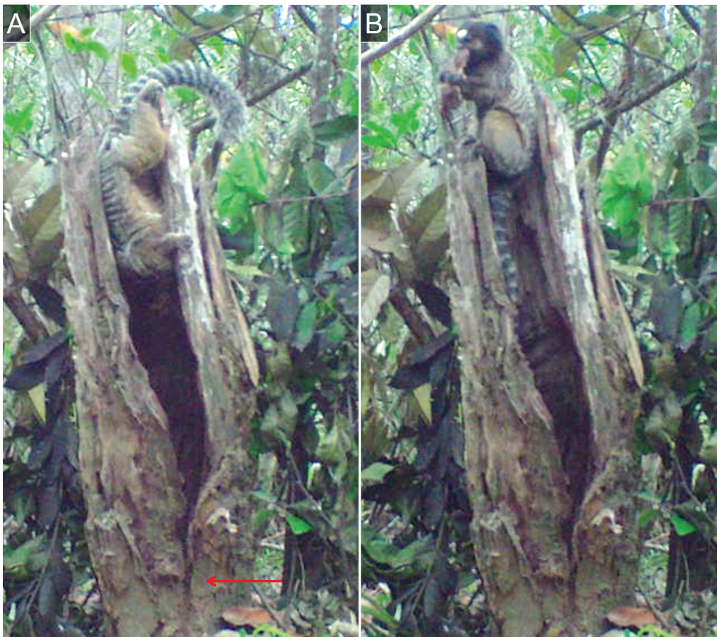
Figure 4. Evidence from a camera-trap of predation of a Rufous Casiornis Casiornis rufus nest by Black-tufted Marmoset Callithrix cf. penicillata : (A) the monkey entering the nest via the opening at the top of the stump, and (B) eating the nestling, head first. The arrow indicates the nest's approximate location in the cavity.

Hawk Geranospiza caerulescens landed at the entrance to the same nest and, from an upright position, inserted its head into the cavity, seemingly trying to detect any noise inside. After c.30 seconds, the raptor inserted its left leg completely into the cavity but, on failing to capture anything, reinserted its head. The hawk continued this behaviour for c.10 minutes, variously inserting either leg into the cavity (Fig. 3C). A few times it removed a considerable amount of material from the cavity, threw this to the ground, and then dropped down to investigate the contents. It proved impossible to confirm that a nestling was taken by the hawk, but as there were originally two chicks in the nest, and only one was seen to be eaten by the monkey, we suspect that the second was predated by the raptor.