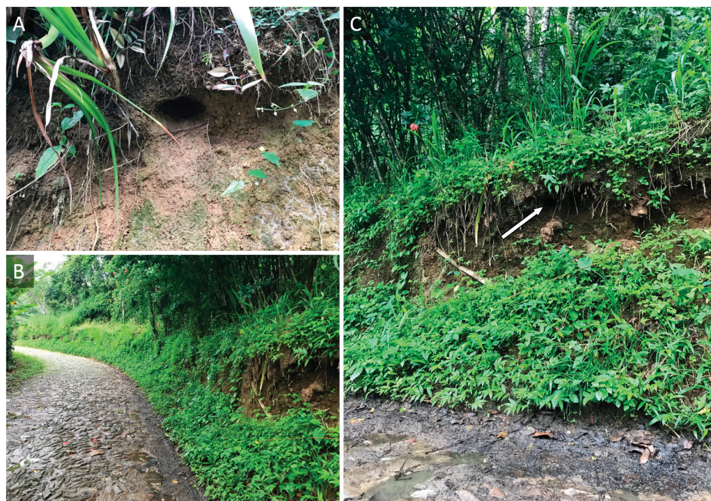
Figure 2. Nest entrance (A) and partial view of the nest site (B–C) of Ceará Leaf Tosser Sclerurus cearensis , Catolé, Ceará, Brazil, June 2020 (Cecília Licarião)