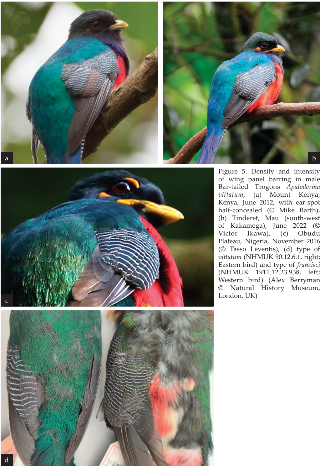
Figure 5. Density and intensity of wing panel barring in male Bar-tailed Trogons Apaloderma vittatum, (a) Mount Kenya, Kenya, June 2012, with ear-spot half-concealed, (b) Tinderet, Mau (south-west of Kakamega), June 2022, (c) Obudu Plateau, Nigeria, November 2016, (d) type of vittatum (NHMUK 90.12.6.1, right; Eastern bird) and type of francisci (NHMUK 1911.12.23.938, left; Western bird)