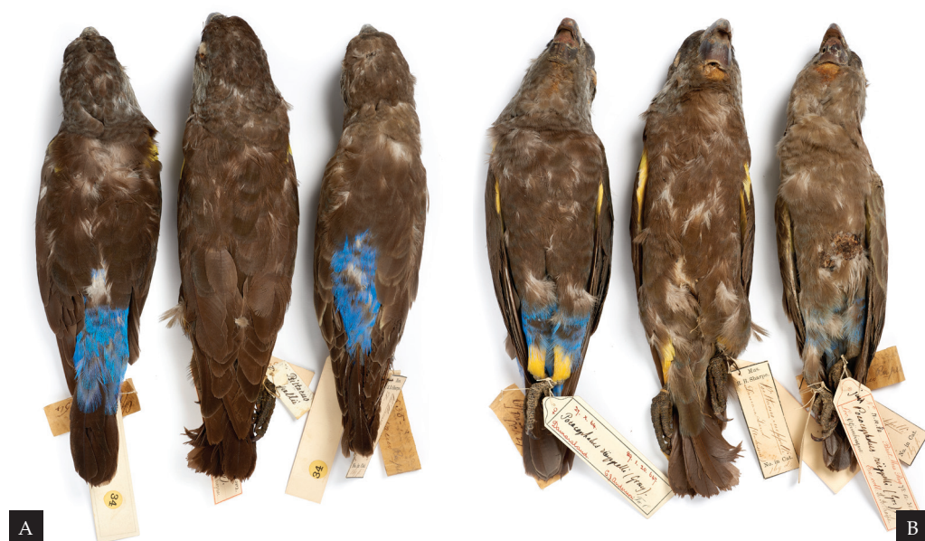
Figure 6. Type material of Poicephalus rueppellii mariettae, from left to right (in both A and B): holotype, adult female, NHMUK 1889.1.20.647; paratypes, adult male, NHMUK 1878.12.31.502, and juvenile, NHMUK 1878.12.31.431, all from Otjimbingwe, Damaraland, Namibia