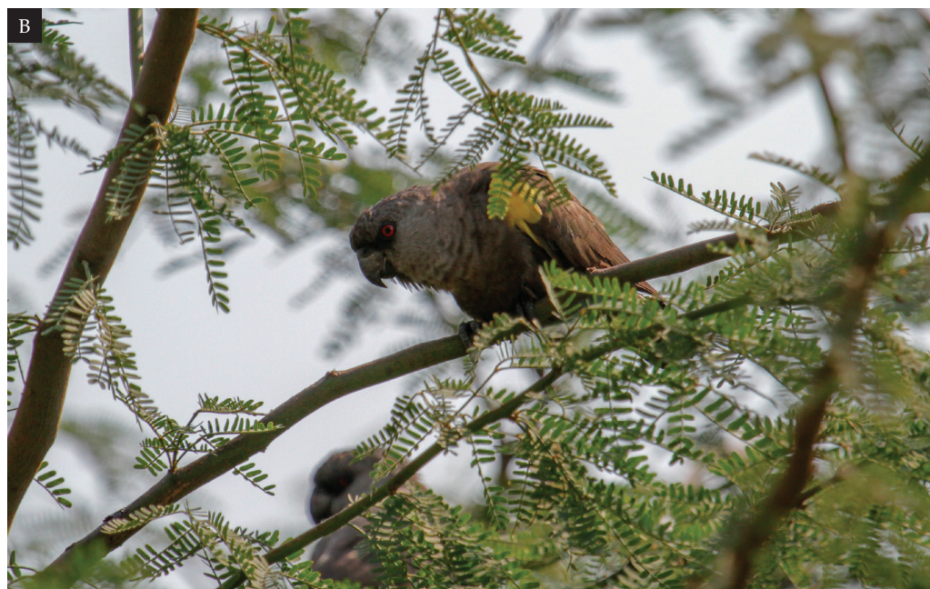
Figure 3. Rüppell's Parrot Poicephalus r. rueppellii from north-west and west-central Angola; note the turquoise-blue plumage in females. (A) adult female, near Luanda, 16 September 2019; (B) adult female, Mirador la Lua, Luanda province, 24 August 2012

birds. However, Gray's holotype of P. rueppellii , a male held at NHMUK, clearly belongs to the northern morphotype. It is relatively small (wing length 135 mm) and dark in overall colour. Furthermore, its label is inscribed 'West-Africa', which term was then applied to an even wider area than today including present-day Angola, and therefore, unlike the original