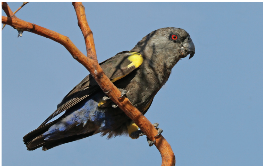
Figure 4. Female of the recently described Poicephalus rueppellii mariettae , Namibia, 4 March 2018; this taxon, with dark ultramarine-blue plumage in females, is better known and more widespread than the nominate subspecies