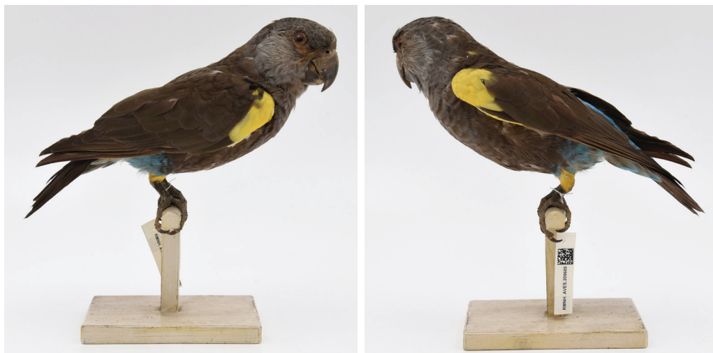
Figure 5. Specimen of nominate Rüppell's Parrot Poicephalus rueppellii from north Angola, in the Naturalis Biodiversity Center, RMNH.AVES.209654, which is smaller and overall darker but has the blue rump and belly paler than birds from south-west Angola and Namibia

description, does not mention 'river Nunez' as its provenance. Consequently, the epithet rueppellii must be assigned to the smaller, darker northern taxon, which as far as is known occurs only around the towns of Benguela and Luanda in Angola. As a result, we propose to restrict the type locality to 'Luanda', after the shared locality of the only two specimens at NHMUK with precise data in this respect (NHMUK 1911.12.18.146, St. Paul de Loanda,