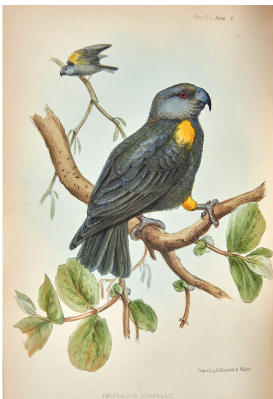
Figure 7. Illustration (pl. V) in Gray's (1848) original description of Rüppell's Parrot Poicephalus rueppellii, based on the holotype (NHMUK 1855.12.19.362) from northern Angola

So, it was Sclater (1882) who was first to notice that female Rüppell's Parrot was more colourful than the male. What Sclater did not see was the difference in size and colour between the parrots received in 1882 and those collected