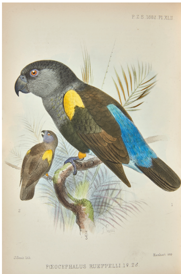
Figure 10. Pl. XLII in Sclater (1882): the bird illustrated was one of two females received by London Zoo in April 1882 from northern Angola, and has the blue rump characteristic of female Rüppell's Parrot Poicephalus rueppellii but which is paler in colour than that of Namibian parrots, a fact Sclater failed to notice

by Andersson in Namibia that he had examined years earlier. The blue in the latter was much darker than that of the birds that died in the Society's Menagerie (= London Zoo) and were collected in 'West Africa' (= Angola, see Figs. 3 and 9). These were of the same morphotype as Gray's (1849) holotype of rueppellii but the differences from the commoner and more widespread Namibian population went unnoticed for 137 years.