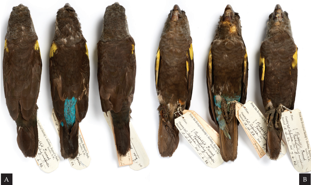
Figure 9. Three of the four specimens received alive at London Zoo in April 1882 and which died in June 1882, from left to right: male, NHMUK 1890.4.1.19; male, NHMUK 1890.4.1.20; female, NHMUK 1890.4.1.21