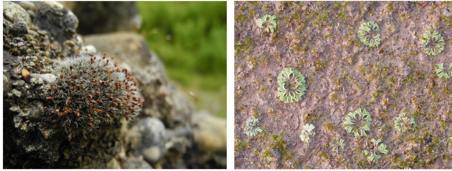
Figure 2. When species grow in discrete cushions such as Grimmia orbicularis (left) or as single rosettes ( Riccia spp., right), individuals rather than ‘individual-equivalents’ may be counted.

consistently specifies how the number of individuals was estimated when calculating population decline: 1) individuals in the strict IUCN sense, or 2) individual-equivalents as described above.