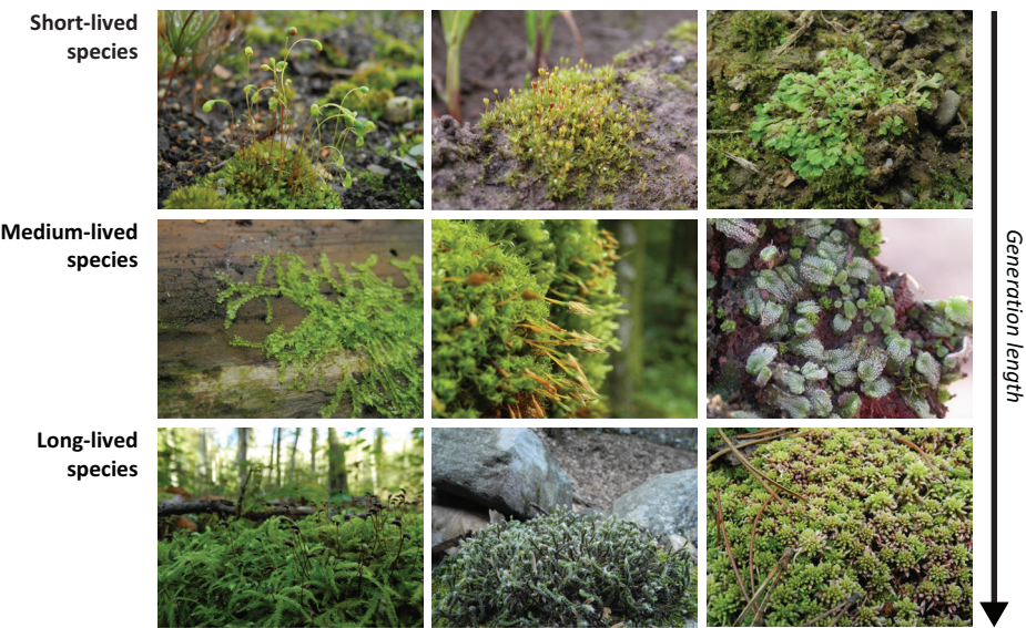
Figure 1. Examples of species with different generation lengths. Species from top left to down right: Funaria hygrometrica (fugitive), Tortula truncata (annual shuttle), Riccia glauca (annual shuttle), Lophocolea heterophylla (pioneer colonist), Ulota bruchii (short-lived shuttle), Exormotheca pustulosa (short-lived shuttle), Brachythecium rutabulum (perennial stayer), Hedwigia ciliata (long-lived shuttle), Sphagnum capillifolium (dominant).

The definitions of ‘individual-equivalents’ as outlined above closely follow the Red List Guidelines (IUCN SPSC 2017), but they are more precise and also more explicit than those originally suggested by Hallingbäck (2007). They are used in all cases where identification of ‘mature individuals’ is not possible. For the European Bryophyte Red List, each individual Red List assessment of a species