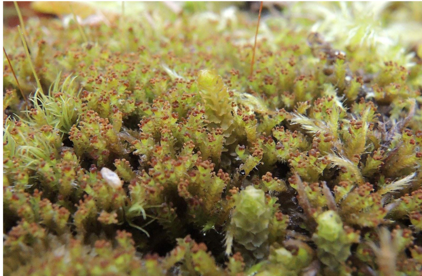
Figure 1. Lophozia lantratovae growing on a boulder in mixed mountain birch forest.

birches in moist to wet areas, often together with species like Lophozia silvicola H.Buch, Ptilidium pulcherrimum (Weber) Vain. and Dicranum montanum Hedw. We have seen material from 310 to 730 m a.s.l.