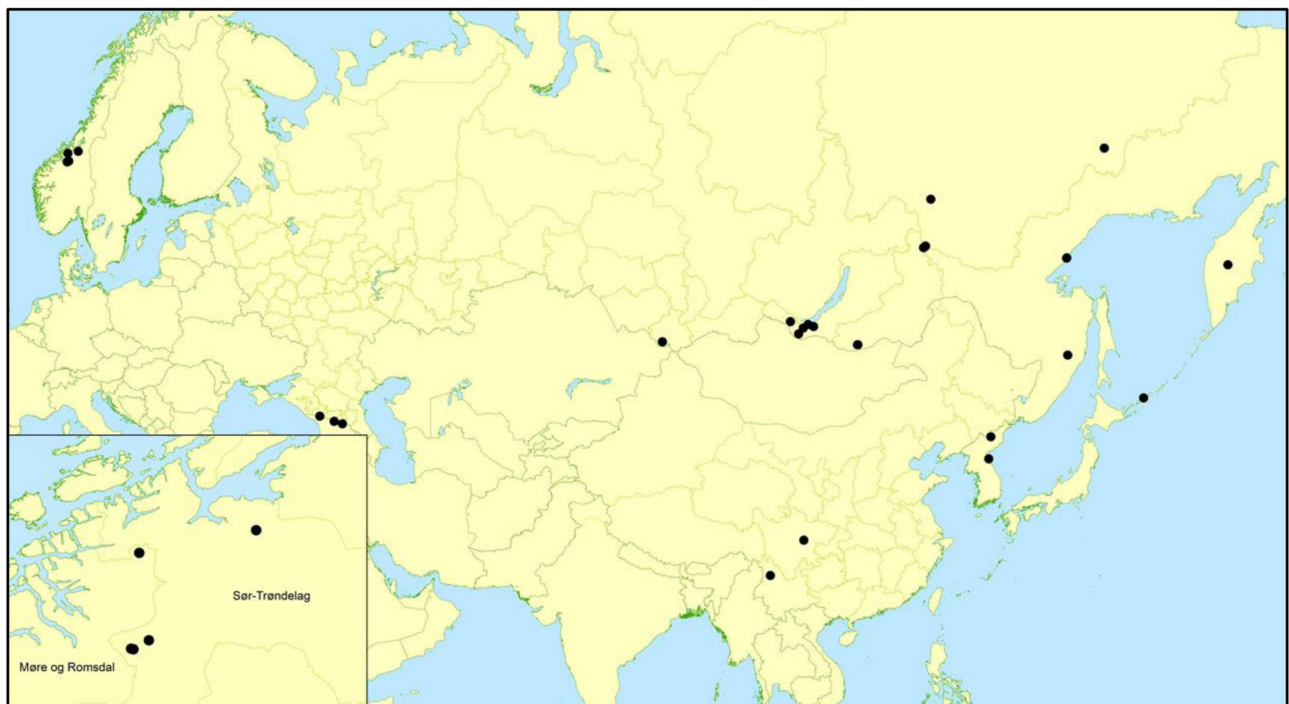
Figure 4. Confirmed distribution of Lophozia lantratovae globally and in central Norway (inset map).

ing, dead Betula pubescens , 35 cm dbh in Picea abies -dominated Vaccinium myrtillus forest., 2021.08.21 T. Prestø, det. T. Prestø (TRH B-116253).