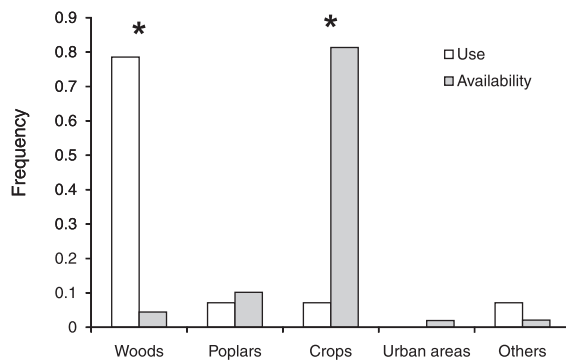
Figure 1. Habitat selection as assessed by badger latrine distribution (* P < 0.001 ).

range boundaries towards the areas of concentrated use, the percentage cover of woods increased significantly ( R^2 = 0.91 , F = 74.8 , P < 0.0001 ), whilst those of both maize and rice fields decreased ( R^2 = 0.74 , F = 19.9 , P = 0.0029 and R^2 = 0.73 , F = 19.4 , P = 0.0031 , respectively).