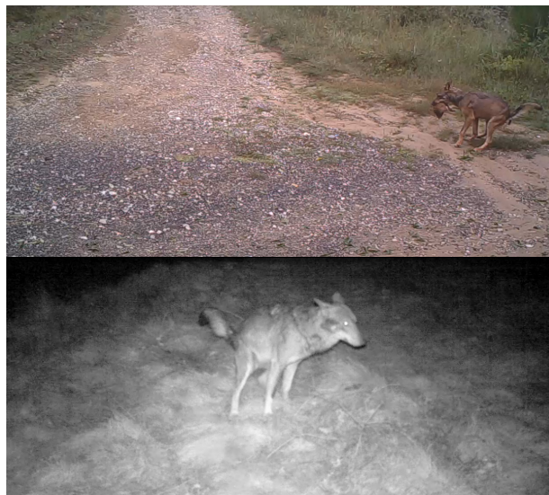
Figure 1. Two images of defecating wolves extracted from videos recorded during remote camera trapping surveys in the Arezzo province (Italy, 2013–2016).

study area – which showed both morphological and genetic signatures of introgression and were members of a breeding pair. This evidence raises a major concern, as their successful breeding would lead to a further spread of canine genes in the population. Successful mating by wolf–dog hybrids in the wild was reported in central Italy (Caniglia et al. 2013) and had previously been hypothesized on the basis of the high proportion of backcrosses observed in other areas of Italy (Randi et al. 2014). Moreover, the spread of domestic genes into the Italian wolf gene pool is particularly worrying, given that this population is sharply differentiated