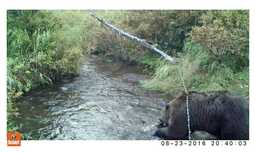
Figure 2. Still image from a video (Supplementary material Video A2) showing a brown bear that contacted a wire deployed to obtain hair samples while it was catching a sockeye salmon in Eagle Creek, Alaska.

Female bears avoided the wires more often than did males. This finding was unexpected because females often seem to be more tolerant of human-disturbed areas than males, and may even use human activity as a shield against male infanticide (Rode et al. 2006, Steyaert et al. 2016). Most females identified in videos were accompanied by cubs, which could make them warier of potential dangers while foraging in streams. For example, elk Cervus canadensis in Yellowstone National Park spent more time being vigilant