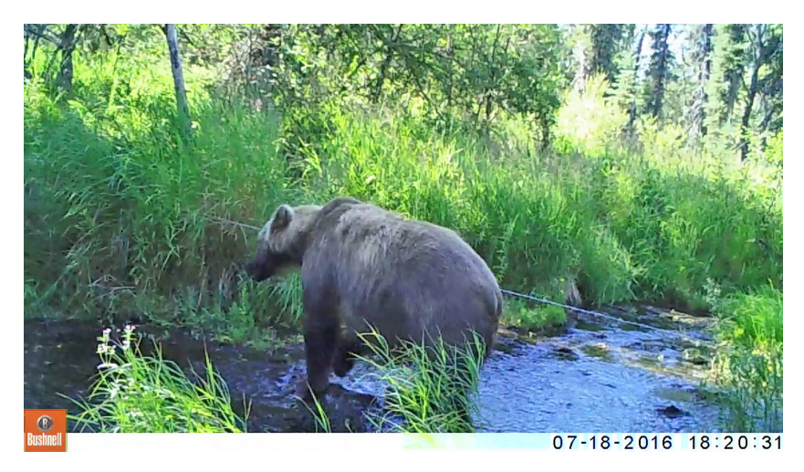
Figure 1. Still image from a video (Supplementary material Video A1) showing a brown bear that apparently inspected and then walked away from a wire deployed to obtain hair samples on Hansen Creek, Alaska.

It was not always possible to determine sex due to the lighting, camera angle and bear position, but of the 350 approaches, 28 female and 90 male bears were identified. Females avoided the wire more often than did males (39.3% of interactions versus 20.0%; Table 1; \chi^2 = 4.29 , 1 df, p = 0.038). There were 274 videos containing adult bears (including those in which sex could not be determined) and 65 videos containing yearling and spring cubs. Adult bears avoided the wire in 21.2% of the approaches, whereas cubs avoided the wire in 12.3% of them (Table 1; \gamma^2 = 2.63 , 1 df, p = 0.10). The videos showed 298 individual bears, and 52 in groups from 2 to 4 bears. Individual bears avoided the wire 20.5% of the time, whereas bears in groups avoided the wire in 11.5% of interactions (Table 1; \chi^2 = 2.28 , 1 df, p = 0.13). The bears were least often detected in the day (Fig. 3). Of the 350 approaches analyzed, 23.7% were during daylight, 17.1% at dusk, 44.9% at night and 14.3% at dawn, indicating a very low approach rate in the day. Bears avoided the wire in 10.8% of the approaches in the day, 19.1% during crepuscular periods combined (16.0% at dawn and 21.7% at dusk) and 23.6% at night (Table 1; \chi^2 = 7.32 , 2 df, p = 0.026).