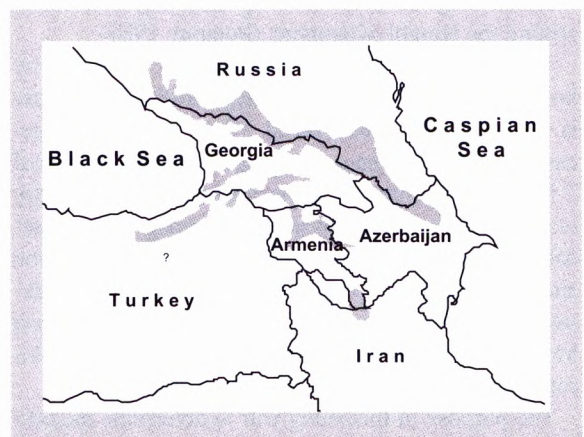
Figure 1. Distribution of the Caucasian black grouse (after Storch 2000).

The Caucasian black grouse is the only grouse species represented in Turkey. According to recent liter-