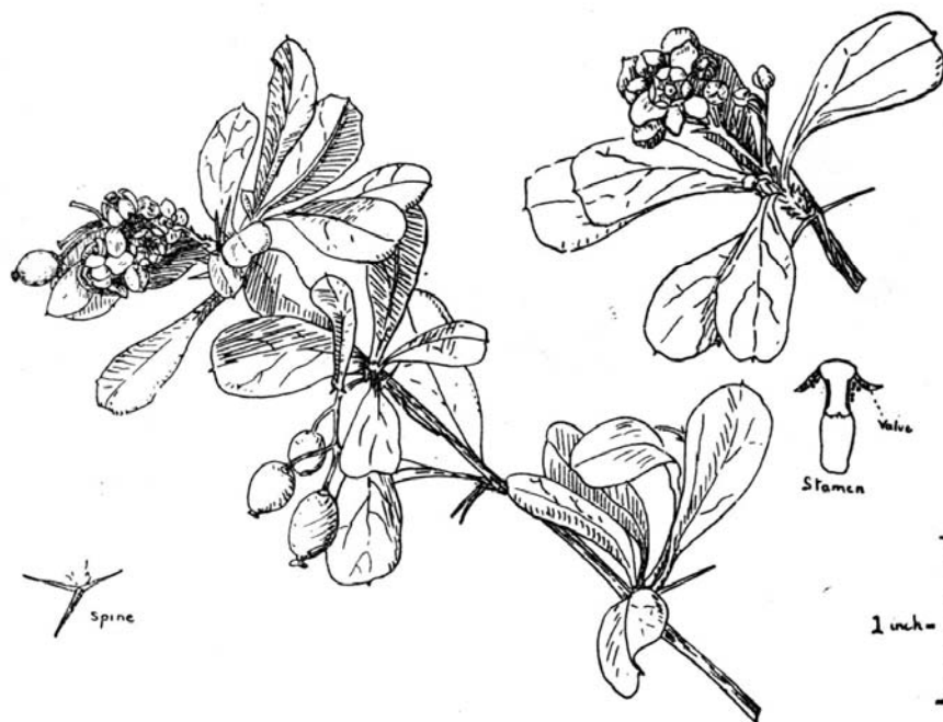
Berberis holstii , Engl.