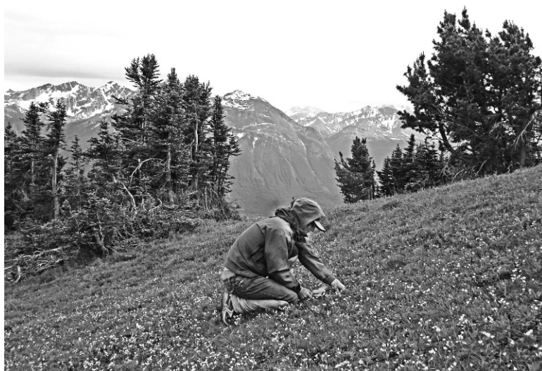
Figure 2. Digging for mountain potatoes (western springbeauty corms – Claytonia lanceolata ) at tsinuzch'ed , British Columbia.

families or clans, in some cases under the proprietorship of a hereditary chief or house leader (Deur 2002a; Turner et al. 2005). Patterns of ownership varied along the Pacific mountain crest, reflecting the broader configurations of land and resource tenure for the communities living along the cordillera. Especially rich montane gathering areas might be accessed and occupied by multiple tribes that maintained overlapping claims to resources at their territorial margins. It is likely that there were many different proprietorship arrangements in these montane areas, as there were for territorial hosting and resource exchange in lowland areas (cf. Suttles 1987; Turner and Clifton 2009; Turner et al. 2005). Since women were primary harvesters and processors of the berries, roots and other plant products, they would be expected to have had an important role in determining access, use and maintenance of their harvesting grounds.