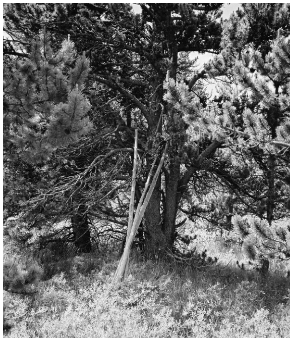
Figure 3. Tent poles of lodgepole pine ( Pinus contorta ) left leaning against a tree at Ts'ylos , Tsilhqot'in territory.

Bones, food scraps, broken tools and unusable plant parts such as the stems of root vegetables would often accumulate at montane camps (Lepofsky 2004; Matson and Magne 2007; Peacock 1998). Poles for shelters and tents, heavy tools such as grinding stones, as well as certain fishing equipment might be left at a camp from year to year (Figure 3; Mellott 2010). Items such as bark trays for drying berries and bark buckets for transport or food storage might be fashioned right on site from trees and other plant materials (Mack and McClure 2002). Sheets of bark and boughs harvested from nearby trees –leaving evidence as CMTs (culturally modified trees; cf. Turner et al. 2009)– were used as “thatch” for roofing, floor covering and bedding for seasonal shelters. Subalpine fir boughs ( Abies lasiocarpa ) are particularly appreciated for this purpose due to their fragrance, softness and springiness (Turner et al. 1990).