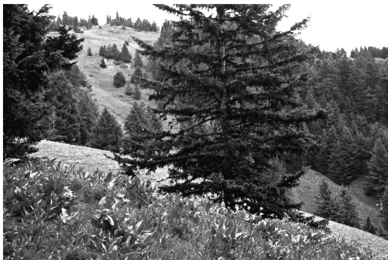
Figure 4. Pt-én'i (Botanie Valley), British Columbia, showing the interface between subalpine meadow and forest communities.

abundance in this place, and all my children shall repair here to dig them" (Steedman 1930:477).