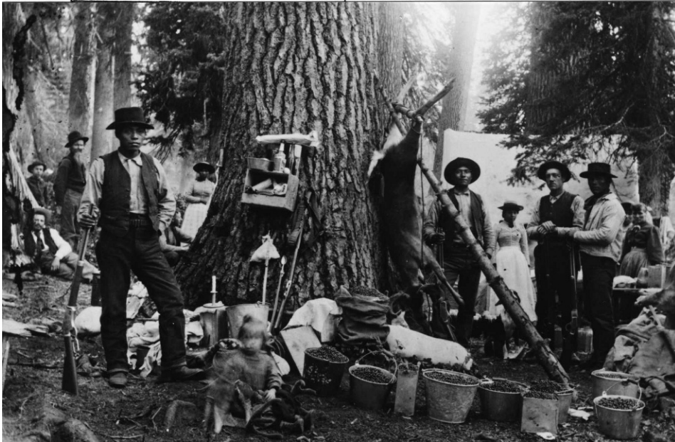
Figure 5. An iwamkani camp in the late-19th or early-20th century. Buckets and gunny sacks of black huckleberry ( Vaccinium membranaceum ) sit in the foreground, while a recently dressed deer ( Odocoileus sp.) is hanging behind. Tents, impromptu shelves, and other items relate to extended residence of tribal members at these campsites. Camps were commonly located under the forest canopy, despite the presence of nearby meadows, providing shade and structural supports for camp equipment.

summer heat of the lowlands and to socialize. While all of the region's tribes maintained discrete territories, subalpine areas such as iwamkani represented multi-tribal use areas lining the territorial boundaries where different tribes seasonally coexisted at resource rich sites. "We all shared the huckleberry patch," tribal elders assert, "All the tribes gathered there." Berries gathered at iwamkani , particularly the huckleberries, were a significant component of the traditional diet for all of these tribes. Moreover, seasonal camps at iwamkani provided people with access to many upland plant and animal resources that were uncommon in their lands in the basins below –especially important for the Klamaths, who dwell in the relatively arid high desert regions to the east of the Cascade Range. The Klamath traditionally watched the snowline recede up the mountains until it was apparent that their campsites were snow-free before beginning to relocate to their montane berry-picking camps. Their Umpqua neighbors to the west, meanwhile, awaited the appearance of certain insects that were said to predictably arrive when their camps were ready (Deur 2002a). Iwamkani thus became a cornerstone of the seasonal round, and one of the most important sources of foods, materials, and medicines to local tribes, a role it still maintains in a much-reduced capacity.