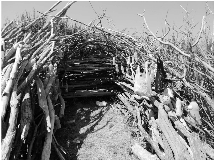
Figure 6. Assemblage of branches and bottles at Conference House Park.