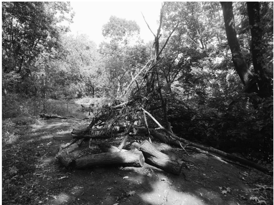
Figure 7. Teepee structure at Inwood Park.