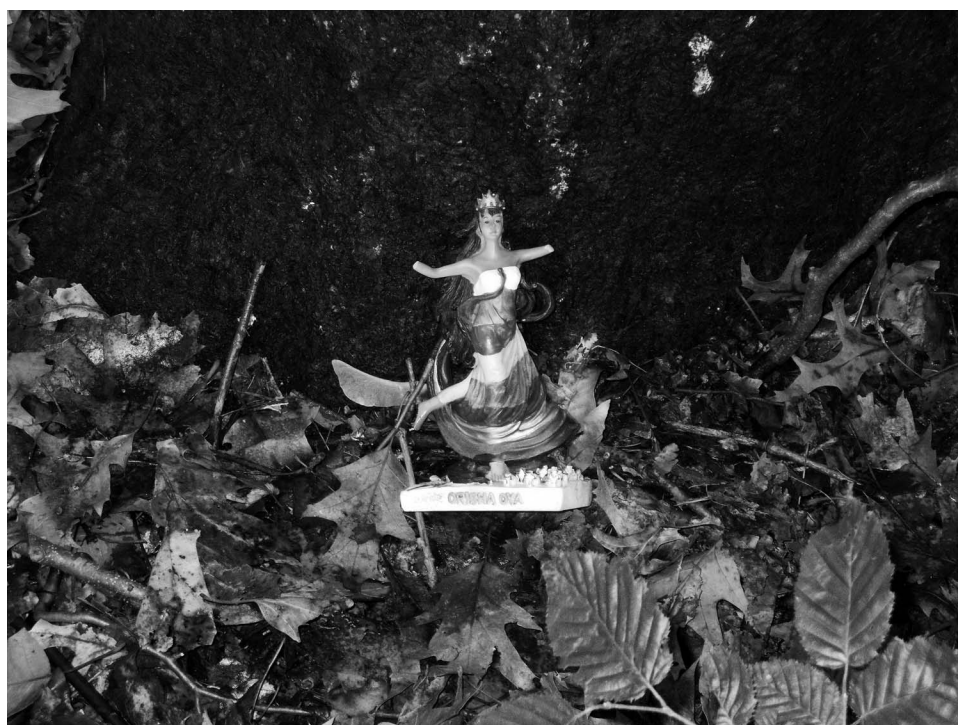
Figure 9. Orisha Oyá figurine at Alley Pond Park.