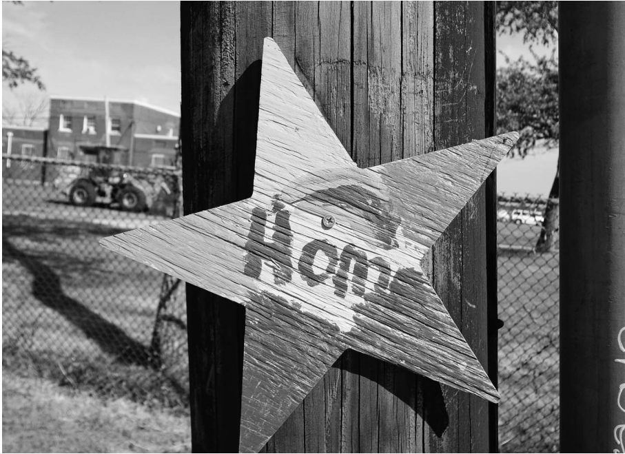
Figure 4. "Stars of Hope" Memorial to Recovery of Hurricane Sandy, edge of Fort Tilden Park.