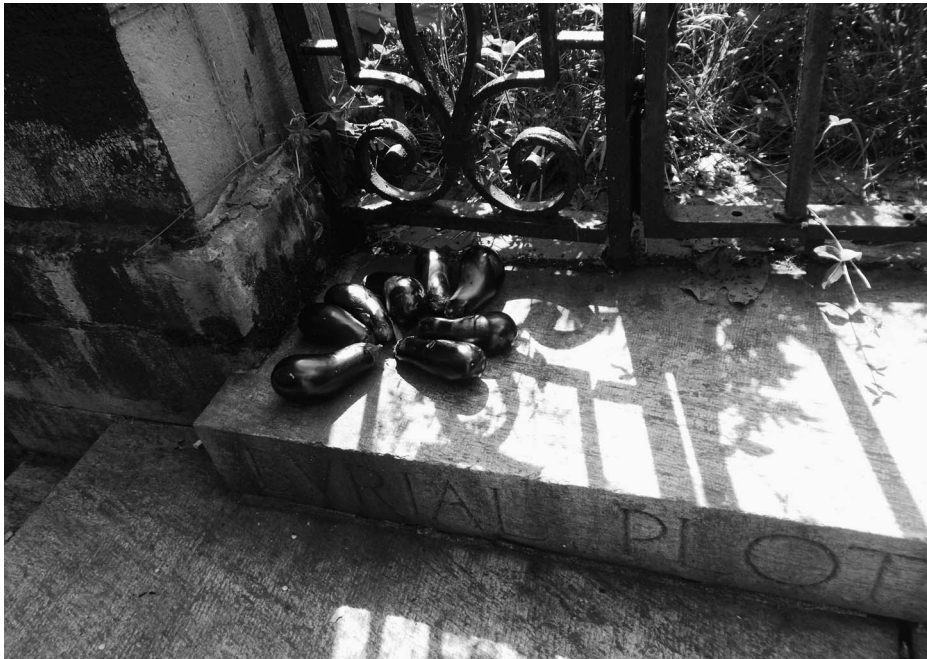
Figure 10. Eggplant offering at burial vault in Van Cortlandt Park.