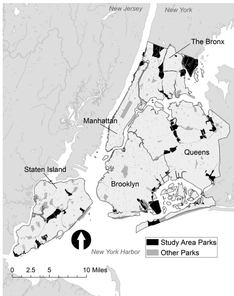
Figure 1. Map of New York City and Locations of Study Parks.

photographing signs of past human use, and field notes. Observed human activities were grouped by function (e.g., sitting, socializing, bicycling, exercise, and nature recreation). Adult interviewees were asked about park use and engagement. We did not conduct interviews with people under 18 years of age because seeking permission from a parent/guardian would have complicated and extended the process. In accordance with administrative policies, interviews were not conducted in National Park Service (NPS)-managed land (i.e., Canarsie Pier, Floyd Bennett Field, Fort Tilden Park, Frank Charles Memorial Park, Hamilton Beach, and Jamaica Bay Wildlife Refuge). Because the interviews were rapid and did not allow time to establish rapport, individuals were not asked about their cultural identities, gender, or age, which can be sensitive and discourage participation. Instead gender and age categories were observed and recorded. Interviewees ( n = 1680 ) were: 56.8% male, 41.9% female, and 1.3%