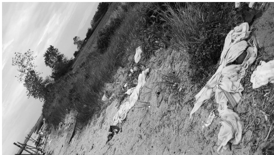
Figure 8. Sari and other Hindu ritual debris at shoreline, Broad Channel American.