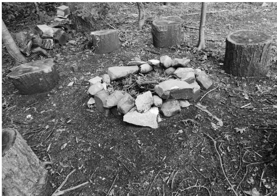
Figure 12. Informal sitting place in Inwood Park.

here seven days a week. This is our second home. If there were eight days we'd be here the eighth day too"; "This place is ours"; "We always come here, we grew up here"; and "Memories and history." Orchard Beach inside Pelham Bay Park in the Bronx demonstrated a high degree of place attachment and sociability. Numerous respondents noted its uniqueness in that it is free, accessible, and provides access to the water, earning it the name "the Bronx Rivera."