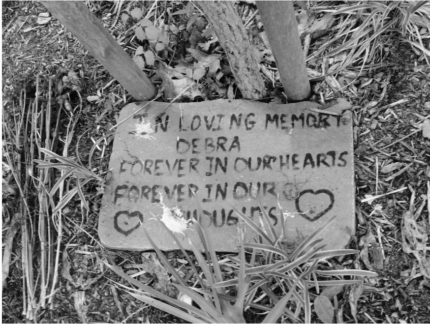
Figure 2. Vernacular memorial at Alley Pond.

can serve as special sites—from explicitly religious practices to a broader set of secular spiritual practices.