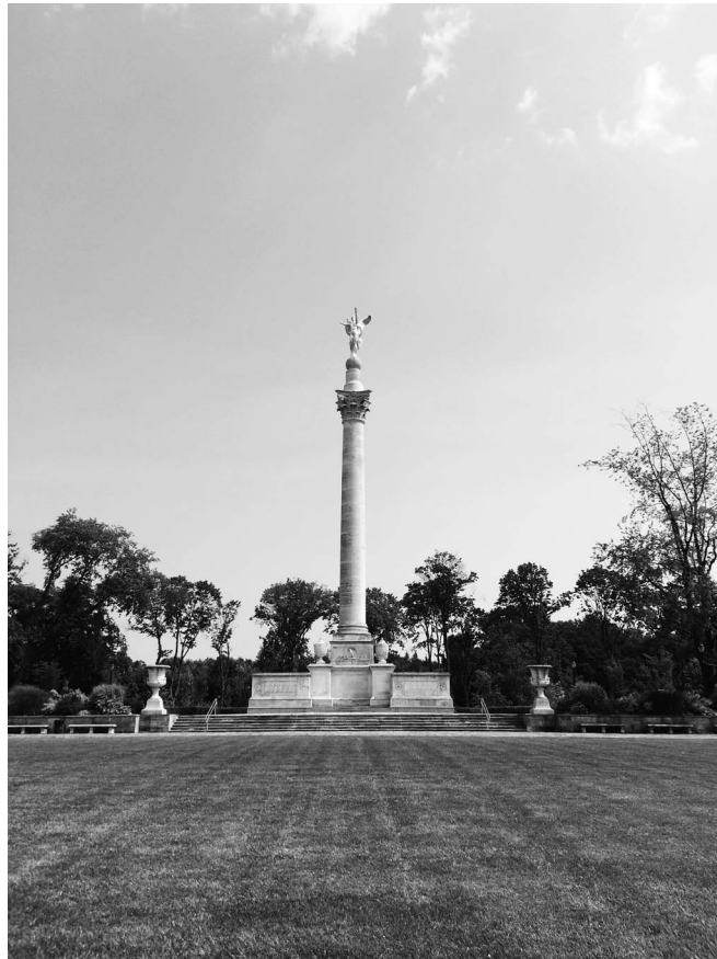
Figure 3. World War I Memorial at Pelham Bay.

Park users also observed the way urban nature resembled more rural spaces. At Inwood Hill Park in Manhattan, a respondent said, “[It’s] quiet, wooded, feels like you’re out of the city.” Although natural areas may have been created as nature preserves, it is clear that they also provide refuge for people.