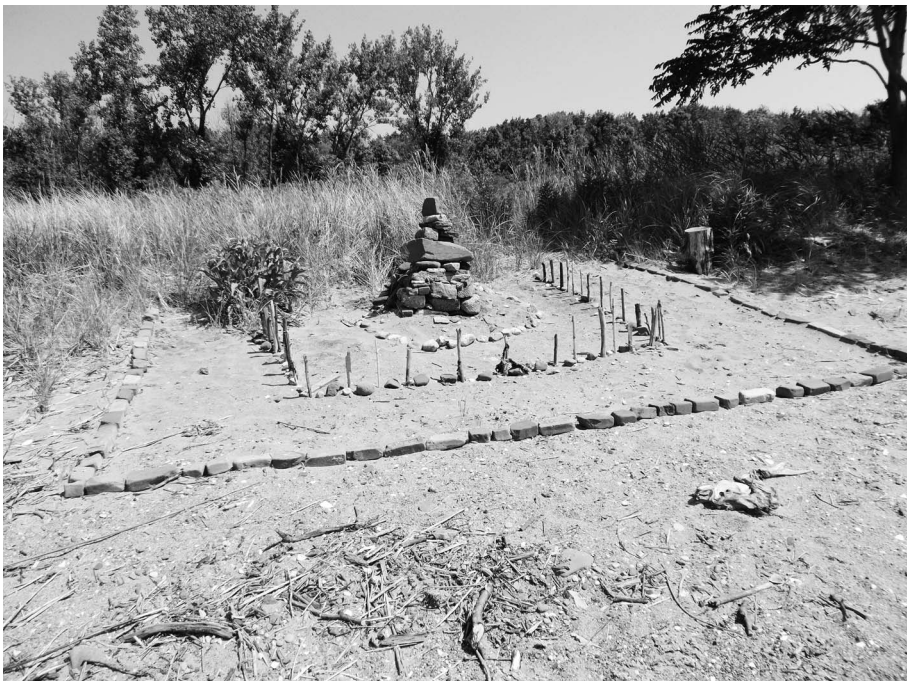
Figure 5. Rock cairn at Conference House Park.