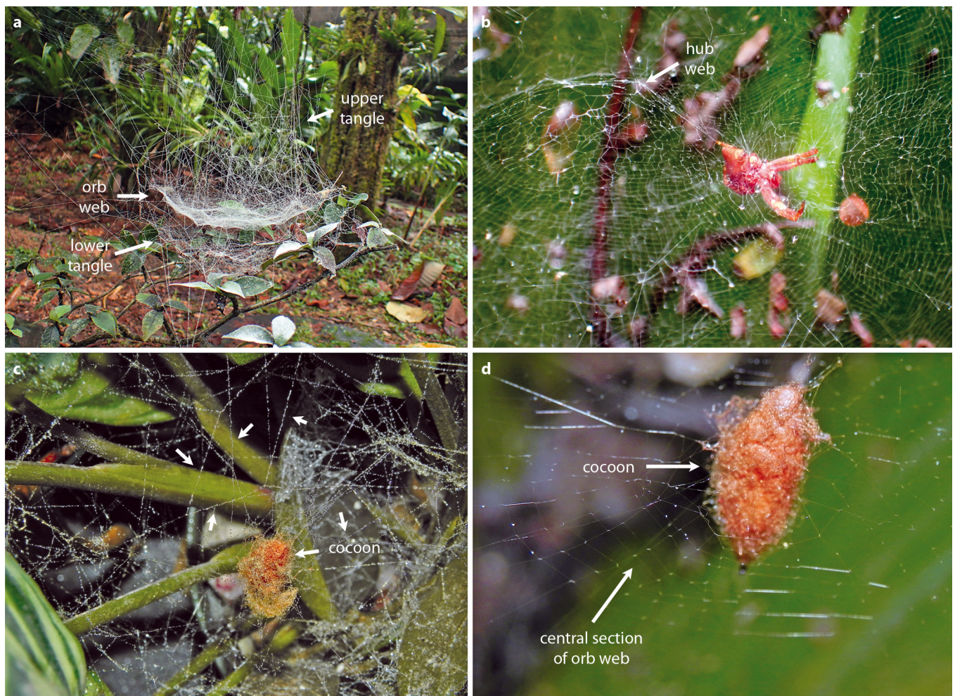
Fig. 1: Distinct aspects of the web of Kapogea cyrtophoroides . a. Natural web in the forest (the web in the picture is similar to at least other 20 webs we have seen in the field). b. The hub of a natural web. c. Cocoon web that the larva induced the spider to build after the spider was removed from its web; arrows point to cocoon web threads. d. Central section of the cocoon web and the wasp's cocoon

to 26.0 °C and the mean annual precipitation from 3500 to 4500 mm at these sites (Martínez 2012, Tirimbina Biological Reserve 2010). Spiders and their hosts were collected in mature and old second growth lowland rainforests.