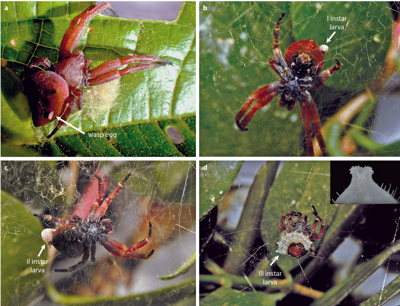
Fig. 2: Egg and different larval stages. a. Egg recently attached to the spider’s opisthosoma. b. First instar larva recently emerged from the egg. c. Second instar larva. d. Third instar larva feeding on the recently killed spider; details of the dorsal hooklets are visible in the inset

During the first two stages, the larva only grew in size, with no obvious morphological changes (Fig. 2b). During this period the larva sometimes appeared to feed on the spider’s hemolymph: the larva’s mouth contacted the spider’s cuticle, and peristaltic contractions moved posteriorly in the anterior section of the larva’s body.