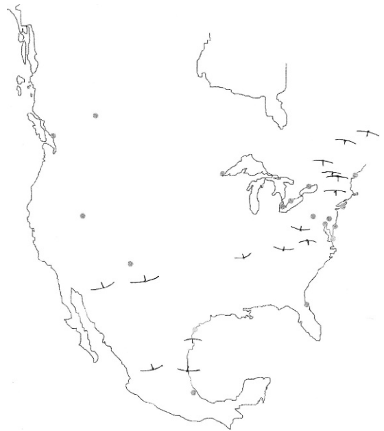
Figure 3. The 1 October migration isophene (i.e., the calculated positions of Peregrine Falcon migrants on 1 October, based on the 50% passage dates). Estimation method described in the text. The arcs indicate positions that peregrines are estimated to have reached on 1 October by traveling in the typical migration direction past the hawkwatch sites studied (Table 1). The line segment on each arc points to its corresponding hawkwatch site, which is located to the north of the arc if October 1 is after the 50% passage date at that site, and to the south if October 1 precedes the 50% passage date. Peregrines at the west coast Fraser estuary site were likely not all long distance migrants, and hence no migration is indicated.

To measure the west-east component of peregrine passage, we estimated the position of the 1 October isophene, which is defined as the position of the migratory front on October 1st (see Byrkjedal and Thompson 1998). We used Fuller et al.'s (1998) estimate of 172 \text{ km d}^{-1} as representative of migration speed, and added or subtracted the expected progression of the observed 50% passage date at each site to 1 October. For example, the 50% passage point occurred in New Mexico (Goshute Mountains) on 23 September, meaning that on 1 October (i.e., 8 d later) it should have progressed southward by 1376 \text{ km} (= 8 \text{ d} \times 172 \text{ km d}^{-1}) . As peregrines move on a broad front, we indicate these calculated positions by arcs of 20^\circ centered on the main direction of migration, which was taken from