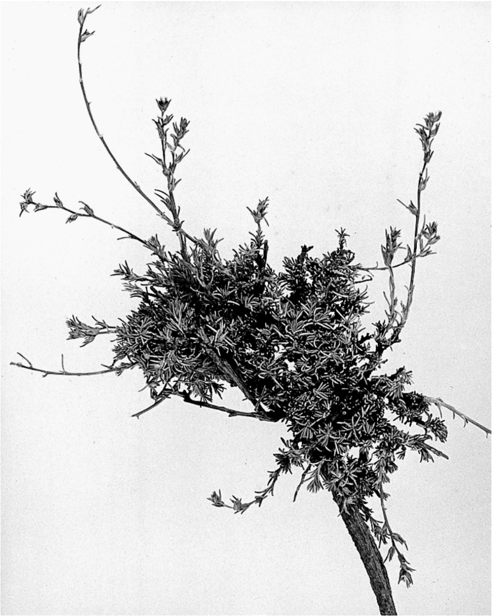
Fig. 1. Salsola canescens subsp. serpentinicola Freitag & E. Özhatay (holotype, ISTE 51123).

subsp. canescens still at hand from the Salsola account for “Flora iranica”, the SW Anatolian plants proved to be sufficiently distinct to give them, at least, subspecific rank. We hesitated to describe them as a new species because all differences except the length of anther appendages could well be induced by the peculiar habitat conditions. This refers in particular to the subulate leaves of subsp. serpentinicola (Fig. 2D), because similar thick and stiff leaves have been seen in a few specimens of subsp. canescens from dry localities in N Iran.