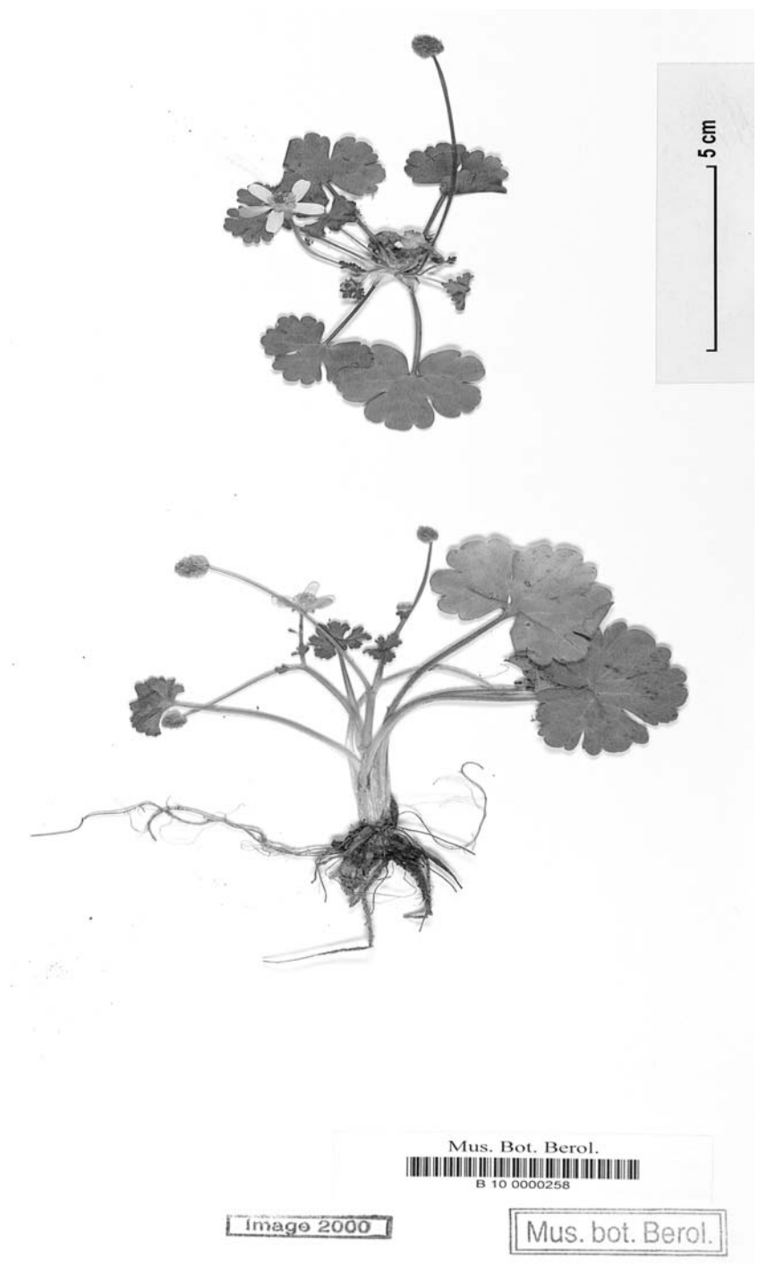
Fig. 2. Ranunculus veronicae – plants of the holotype sheet ( Böhling 7066) at B.