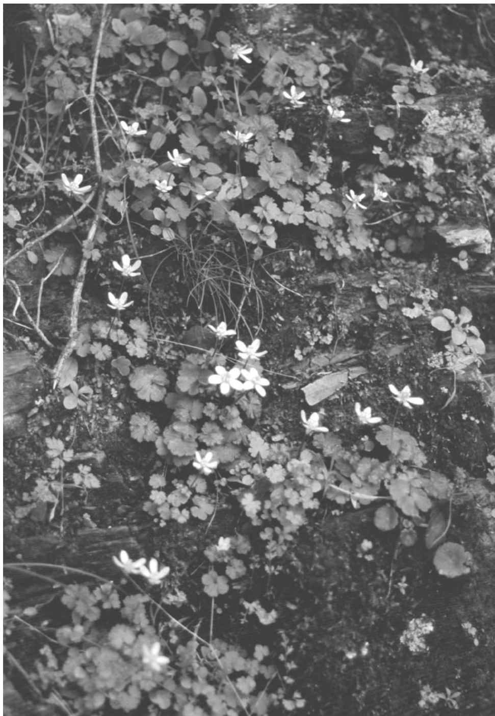
Fig. 3. Ranunculus veronicae – plants at the locus classicus near Kambos, Crete.