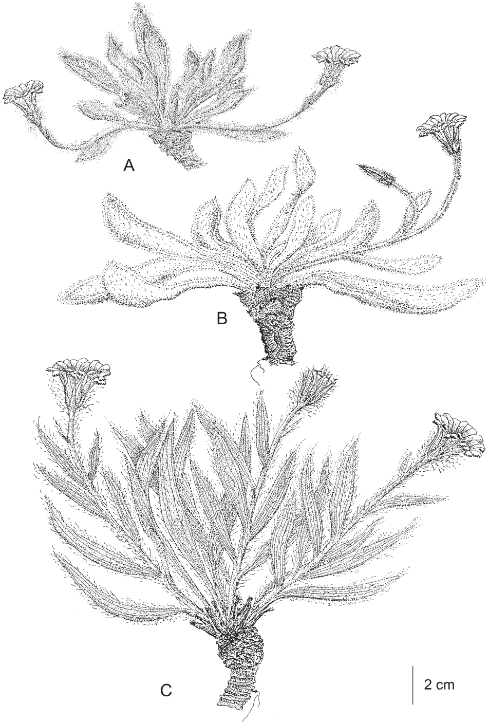
Fig. 2. Scorzonera karabelensis (A), S. ulrichii (B), S. pisidica (C) . – A after R. Ulrich 3/7b, B after R. Ulrich 2/12, C after R. Ulrich 2/22; drawings by Alexander Ehler (BGBM).