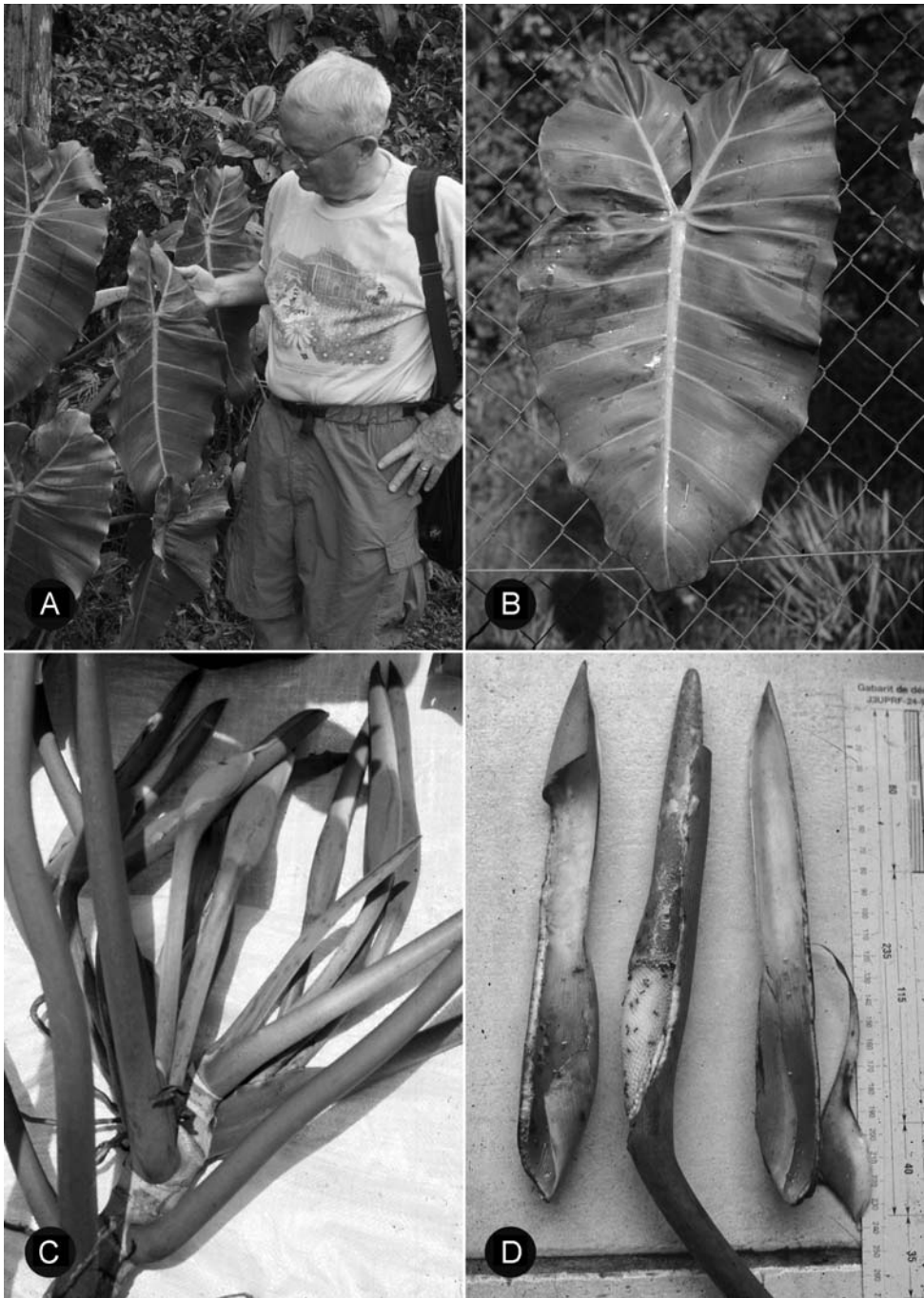
Fig. 2. Philodendron scottmorianum – A: habit of plant in cultivation with Dr Scott Mori at Emerald Jungle Village, French Guiana; B: leaf blade showing adaxial surface; C: stem with bases of petioles and clusters of inflorescences borne in two different leaf axils; D: inflorescence cut open to expose the inner surface of spathe and the spadix (centimetre ruler to show scale).