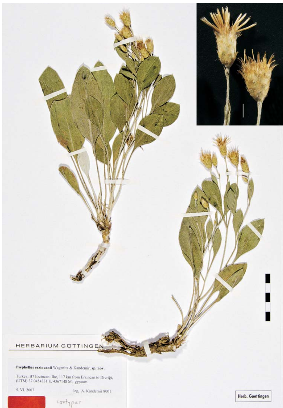
Fig. 1. Psephellus erzincani – isotype at GOET. – Scale bars: overall view = 5 cm, detail view = 5 mm.