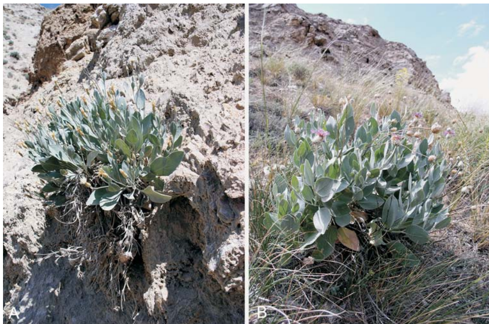
Fig. 2. A: Psephellus erzincani ; B: P. recepii . – Photographs of both species taken by A. Kandemir at their type localities, A on 5 June 2007, B on 9 June 2007.

Perennial with woody rhizome. Stems 20-23 cm high, slender, ascending, appressed-grey-tomentose, ramified near the base, plants with 3-8 capitula. Leaves white-tomentose when young, later thinly appressed-tomentose and \pm glabrescent, with a minute cartilaginous tip, elongate into a mucro in the uppermost leaves, undivided, in the lower and median ones 2-3.5 cm broad, oval, and, apart from the uppermost, with a long petiole, in the lower leaves petiole longer than the blade, in the median nearly equally long, upper leaves narrowed into a short petiole. Involute at flowering time nearly cylindrical, 15-16 mm long, 7-8 mm broad, at fruiting time narrowly funnel-shaped. Phyllaries in many series, greenish, with prominent longitudinal nerves; appendages membranous, stramineous, in the median phyllaries triangular, shortly decurrent, ciliate with