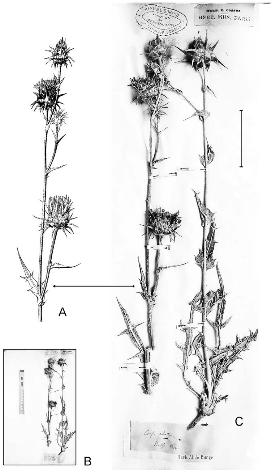
Fig. 1. Comparison of the illustration of Cousinia elata by Buhse (1899) with herbarium material – A: part of original illustration by Buhse (1899); B-C: herbarium sheet ( Buhse 1046/5 , P) with two specimens. – Scale bar: 5 cm.