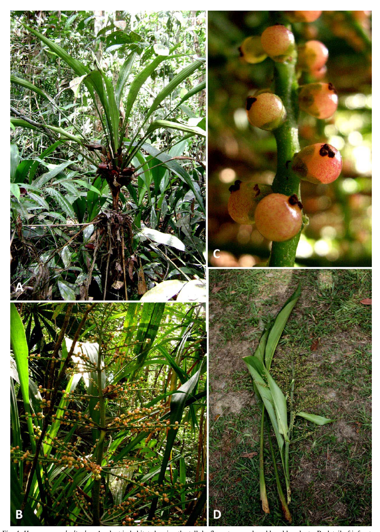
Fig. 4. Hanguana podzolicola – A: plant in habitat showing the tall, leafless stem produced by older plants; B: detail of infructescence, note the open nature of the panicle and the spreading branches of the partial inflorescences; C: ripe fruits, with the stigma obliquely to sublaterally inserted by longitudinally bending of ovary; D: median leaf and inflorescence. – A–D: Siti Nurfazilah & al. HA-49 ; images © Rosazlina Bt Rusly.