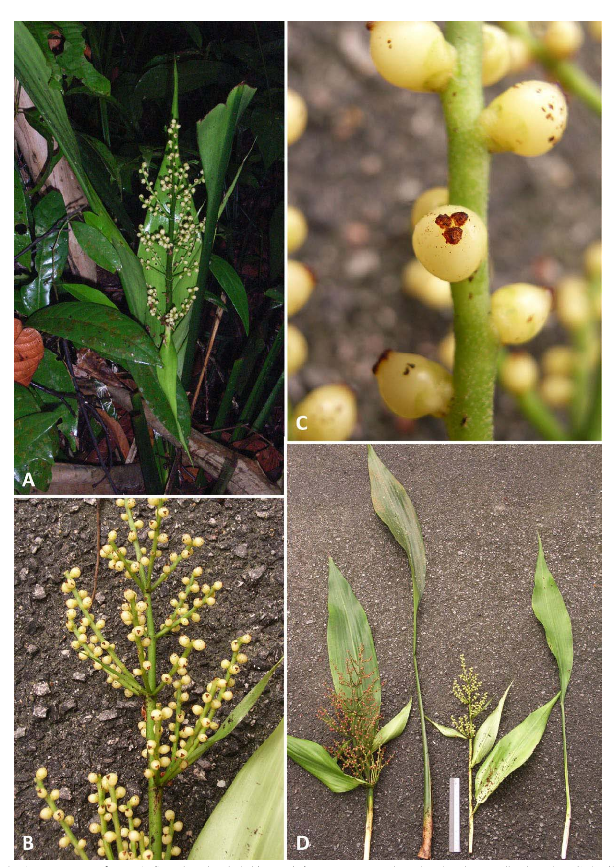
Fig. 1. Hanguana exultans – A: flowering plant in habitat; B: infructescence, note the rather sharply ascending branches; C: detail of the ventrally gibbose-ellipsoid fruits ripening pale yellow with a sessile stigma comprising 3 separate (not connate) orange brown lobes; D: median leaf and inflorescence of H. pantiensis (left) compared with H. exultans (right). – A–D: Siti Nurfazilah & al. HA-55 ; images © Rosazlina Bt Rusly.