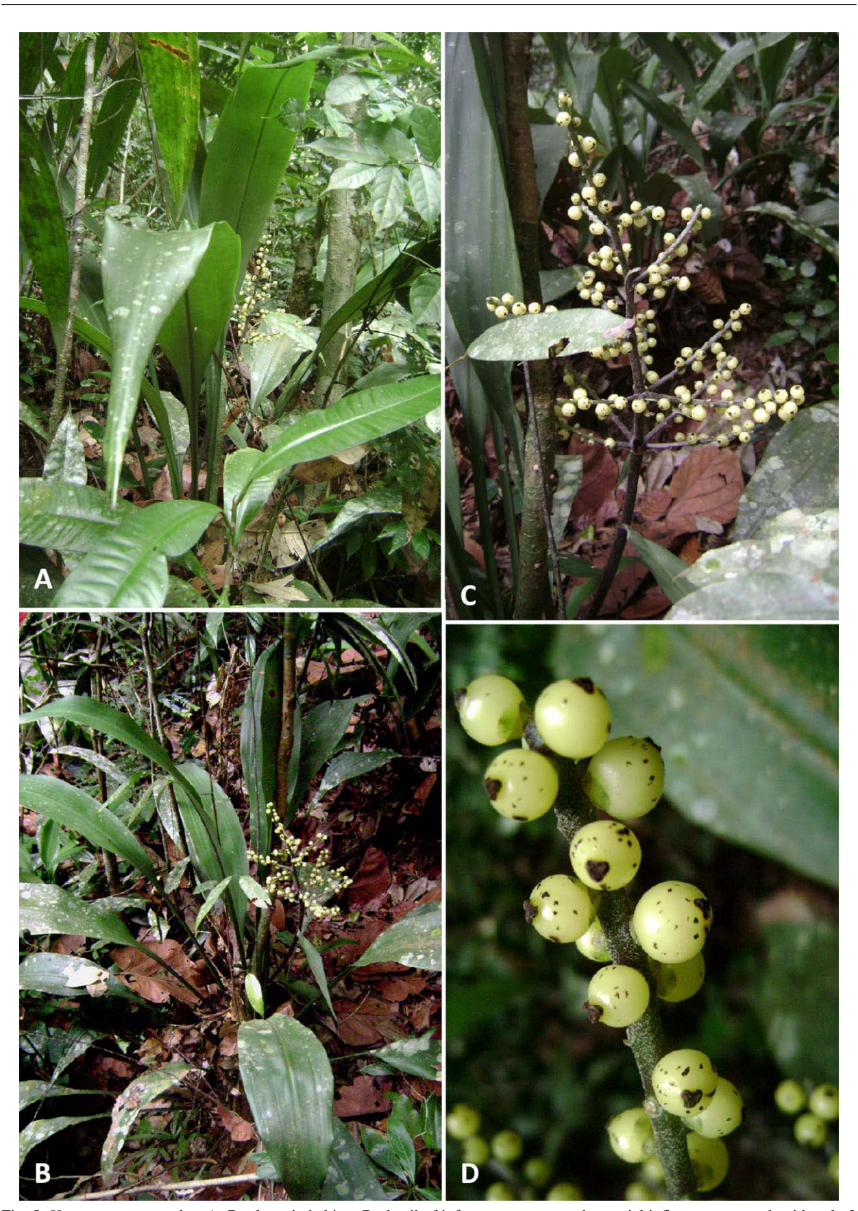
Fig. 5. Hanguana stenopoda – A–B: plants in habitat; B: detail of infructescence, note the partial inflorescences each with only 2 or rarely 3 branches and that the subtending bracts have fallen; D: ripe fruits with opaque tepals, briefly stipitate stigma, with the lobes connate, deep chocolate brown, and the fruit with conspicuous black speckles. – A–D: Siti Nurfazilah & al. HA-60 ; images © Siti Nurfazilah Bt Abdul Rahman.