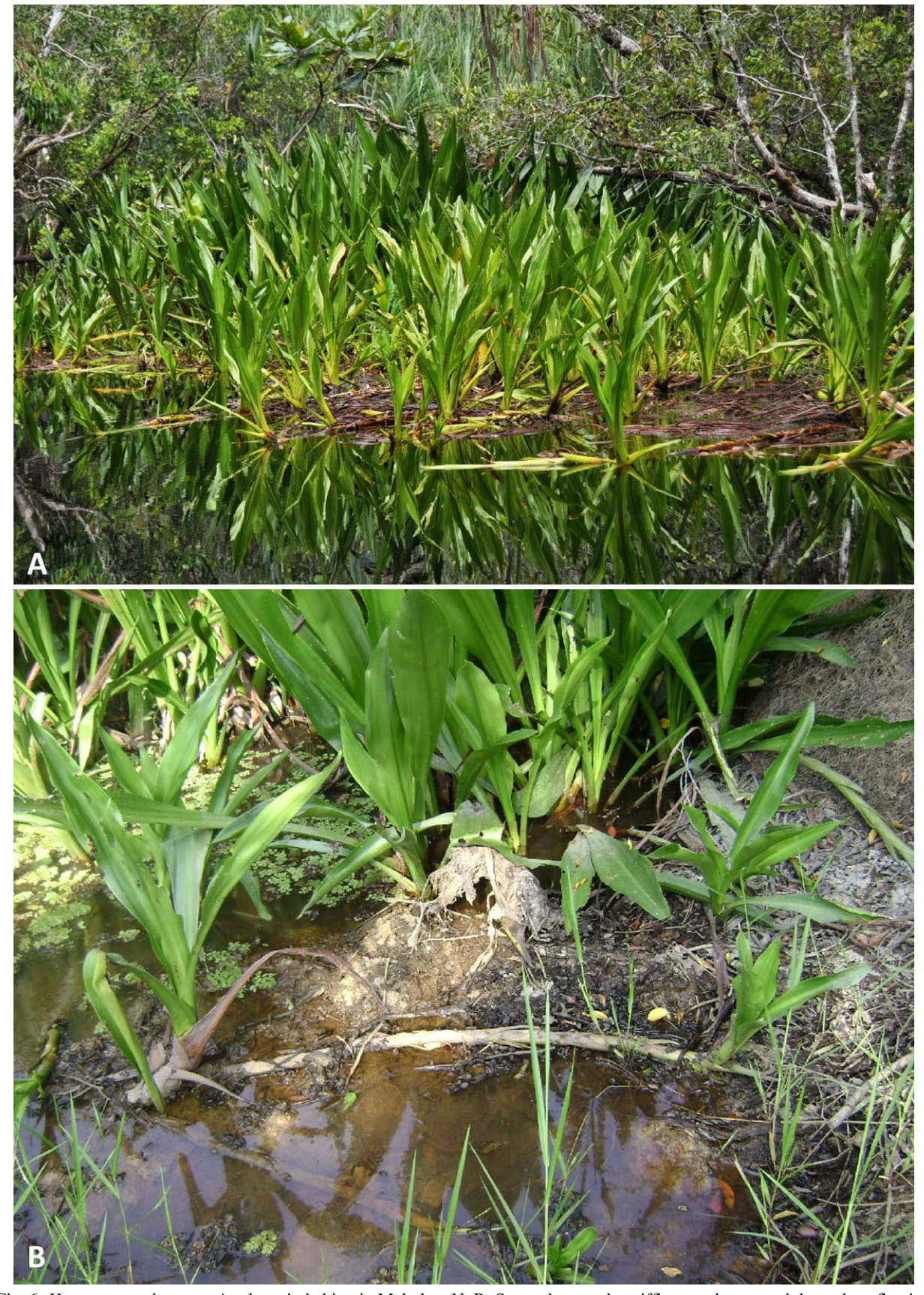
Fig. 6. Hanguana malayana – A: plants in habitat in Maludam N. P., Sarawak, note the stiffly erect leaves and the stolons floating on the water surface; B: detail of semi-terrestrial stolons in habitat, Perak. – A: image © Mike Lo; B: image © Siti Nurfazilah Bt Abdul Rahman.