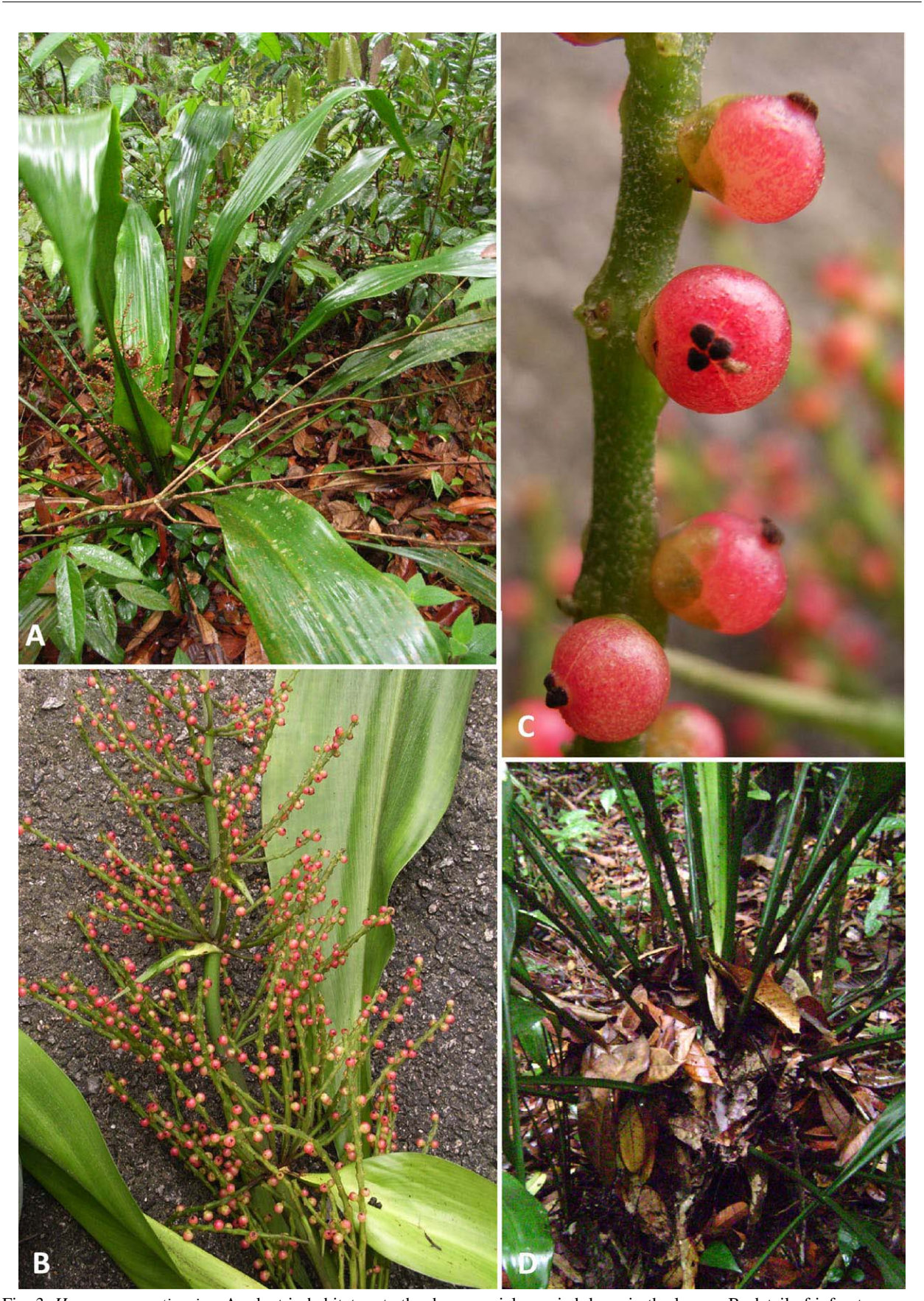
Fig. 3. Hanguana pantiensis – A: plant in habitat, note the dense panicle carried down in the leaves; B: detail of infructescence, note the dense panicle with branches of the partial inflorescences ascending; C: ripe fruits, with the stigma obliquely to sublaterally inserted by longitudinally bending of ovary; D: leaf bases showing litter-trapping. – A−D: Siti Nurfazilah & al. HA-56 ; images © Rosazlina Bt Rusly.