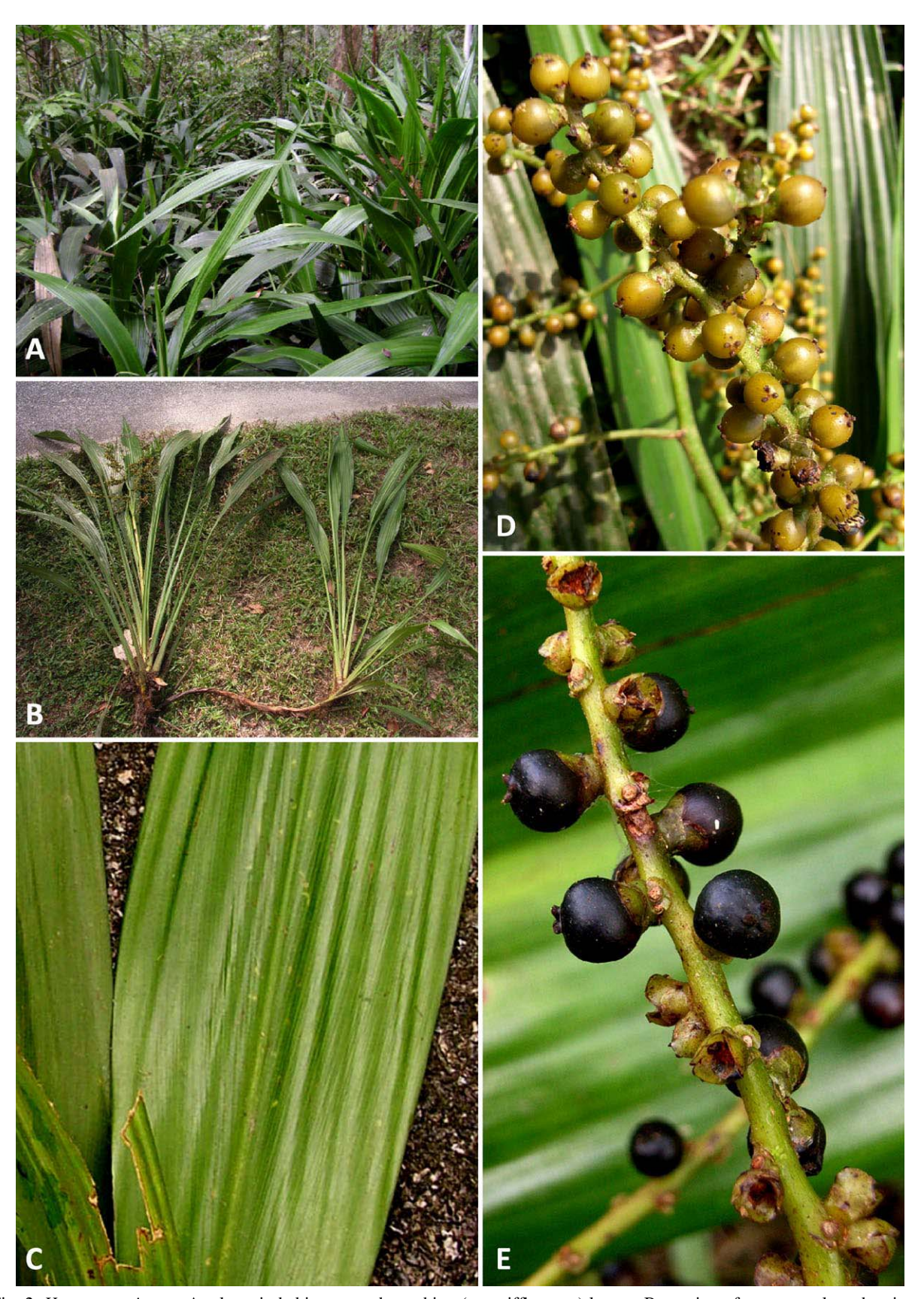
Fig. 2. Hanguana nitens – A: plants in habitat, note the arching (not stiffly erect) leaves; B: portion of a mature plant showing a stolon and the conspicuous, long (^2/_3-^1/_4) of the leaf length) pseudopetiole; C: plicate leaf blade; D: portion of an immature infructescence, compare the separate, erect, pointed stigma lobes with those of H. malayana (Fig. 7B); E: ripe fruits. – A–E: Siti Nurfazilah & al. HA-48 ; images © Rosazlina Bt Rusly.