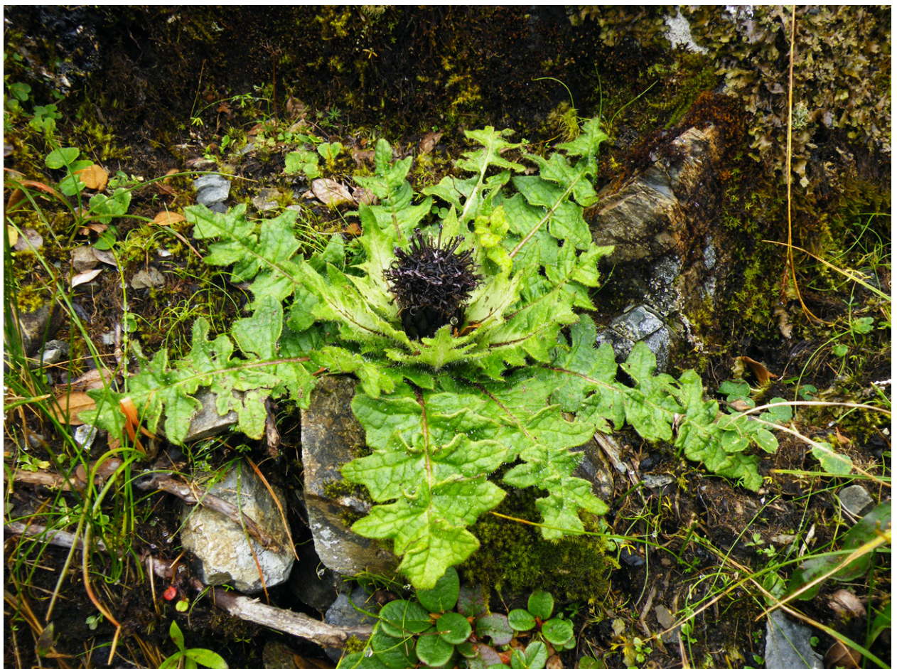
Fig. 1. Dolomiaea taraxacifolia – habit (China, Yunnan, Gongshan Xian, Bingzhongluo, Sijitong, Chuganchu lake, [27°59'14"N, 98°28'23"E], 3880–4000 m, 5 Sep 2009).

to 7 cm long, covered with brown multicellular hairs; leaf blade abaxially light green, adaxially green, oblong to elliptic, deeply and irregularly pinnatifid to pinnatifid, 6–12 \times 3–7 cm, abaxially sparsely covered with short brown multicellular hairs and with sessile vesicular glands, adaxially sparsely covered with brown multicellular hairs, base obliquely truncate, apex obtuse with a purple mucro; lateral lobes 4–6 pairs, oblong, margin entire or sometimes with 1 or 2 large teeth; uppermost stem leaves 5–7, subtending capitulum, sessile, adaxially whitish in central part, 4–9 \times 1.5–4.5 cm, both surfaces sparsely covered with short brown multicellular hairs, margin distinctly toothed to pinnatifid, apex acute. Capitulum solitary, terminal on stem; involucre broadly campanulate, c. 3 \times 3–4 cm; phyllaries in c. 5 rows, imbricate, abaxially dark brown, coriaceous, glabrous, margin entire in basal part, minutely toothed in apical part, apex acuminate; outer phyllaries ovate to oblong, 15–19 \times 5–8 mm; middle phyllaries ovate to lanceolate, 15–22 \times 4–6 mm; inner phyllaries narrowly lanceolate, 23–25 \times 2.5–3 mm; receptacle flat, alveolate, glabrous. Florets numerous; corolla blackish purple, 25–30 mm long, tube 13–18 \times 0.4–0.5 mm, glabrous, limb 7–11 mm long, throat 3–5 \times 1.5–2 mm, with ve-