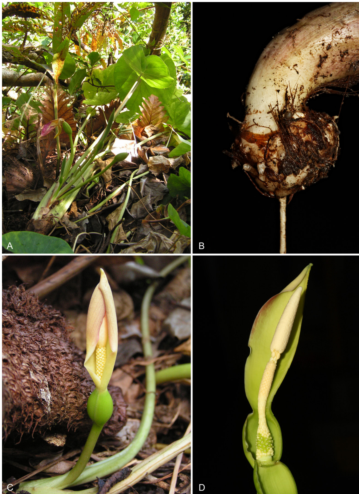
Fig. 2. Alocasia evrardii – A: plant in habitat; B: tuberous stem; C: inflorescence at anthesis; D: young inflorescence with spathe tube opened to show spadix. – Photographs: Vietnam, Binh Thuan province: Takou Nature Reserve area, 2 Oct 2009, H. T. Luu.