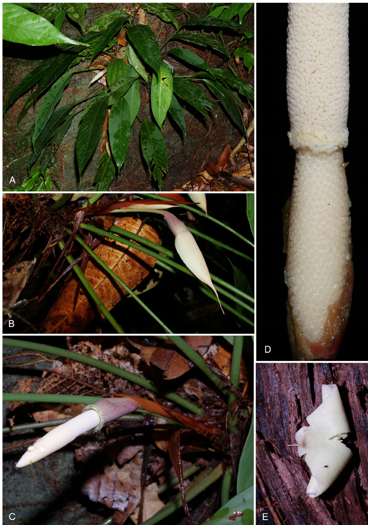
Fig. 3. Schismatoglottis nicolsonii – A: plants in habitat, edge of sandstone waterfall, Bako N. P.; B: flowering plant in habitat; C: inflorescence at onset of staminate anthesis, with spathe limb shed; D: detail of pistillate zone and lower part of staminate zone. Note that staminate zone is fertile to base; E: spathe limb shed during onset of staminate anthesis. – All from P. C. Boyce & al. AR-2106.