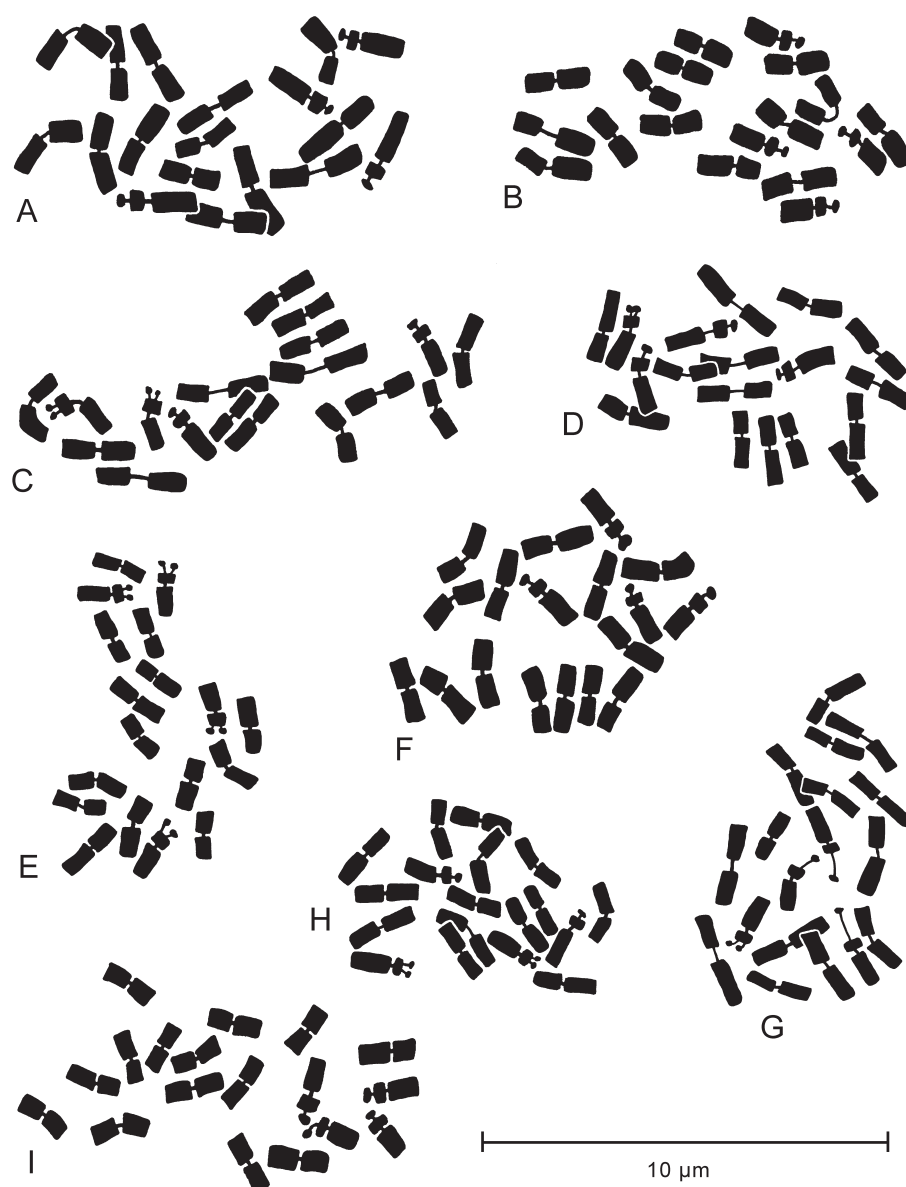
Fig. 2. Somatic metaphases of Achillea taxa (all with 2n = 2x = 18 chromosomes) for which no karyotype information was found in literature. – A: A. atrata (12623); B: A. erba-rotta (14446); C: A. grandifolia (12611); D: A. macrophylla (1840); E: A. moschata (11630); F: A. nana (11833); G: A. pindicola subsp. integrifolia (11337); H: A. ptarmica (12709); I: A. tomentosa (11454).