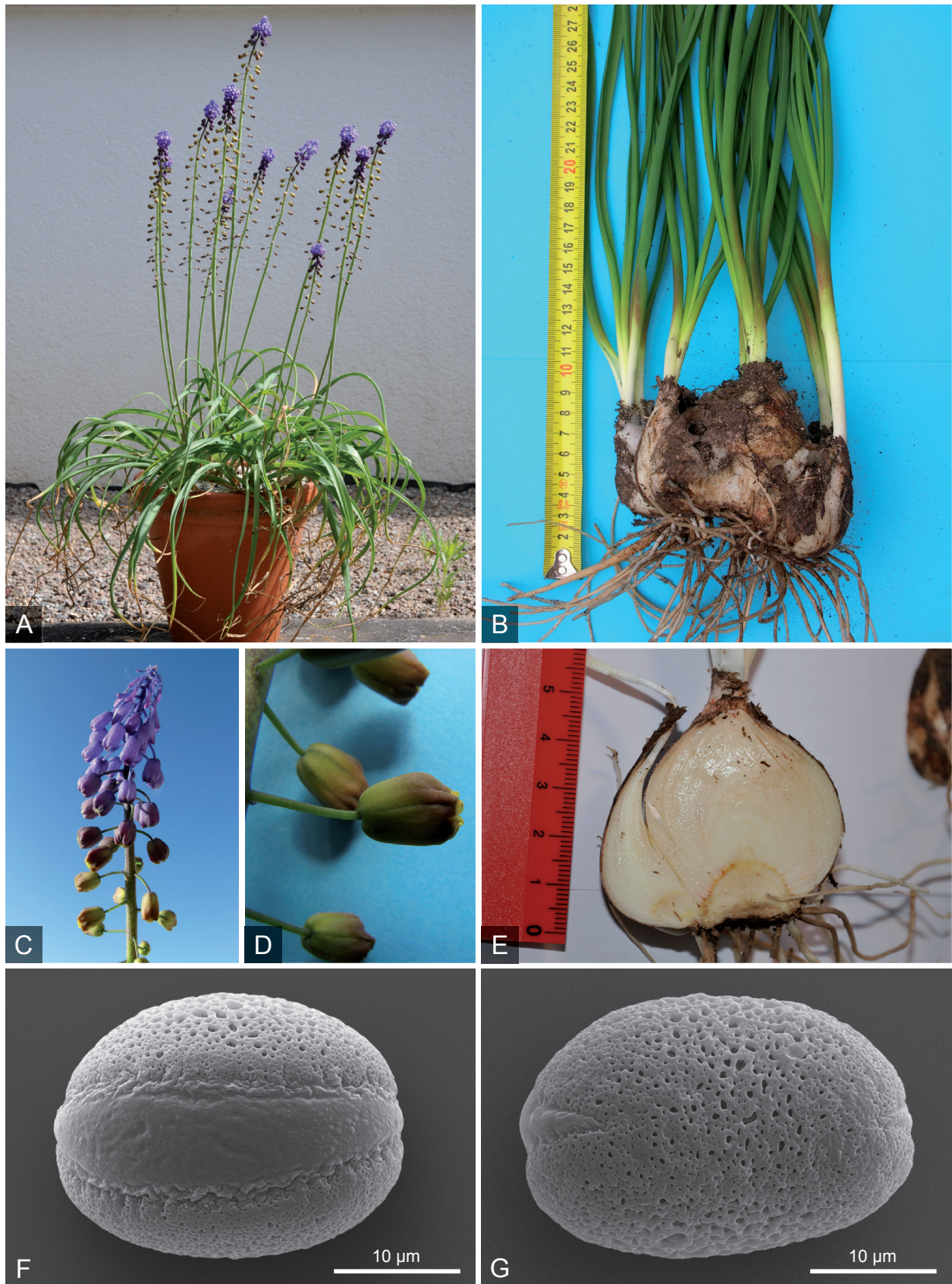
Fig. 2. Additional diagnostic characters of Leopoldia neumannii . – A: clump of individuals in cultivation; B: bulb with several bulbils; C: upper section of inflorescence with violet sterile flowers; D: close-up of fertile flowers; E: longitudinal section of mid-size bulb with bulbil; F, G: pollen grains. – Photographs: A, E by T. Böhnert; B–D by M. Neumann; F, G by J. Jeiter.