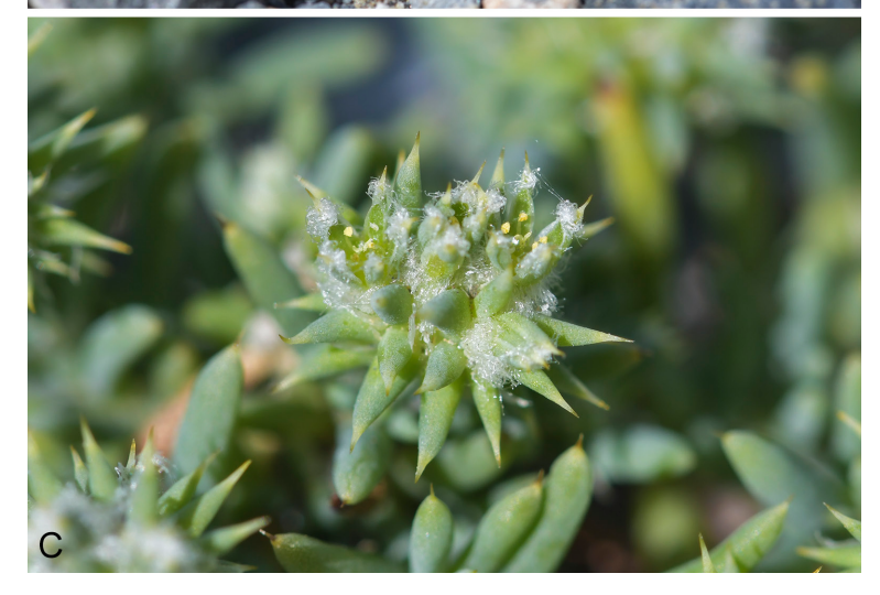
Fig. 1. Gymnocarpos sclerocephalus – A, B: two individuals found in the rambla of Lanujar; note the heterogeneous, stony nature of the soil; C: close-up of the inflorescence; note the tightly clustered flowers, spiny bracts and sepals, and white hairs covering the sepals. – A–C: Spain, Almería, 17 Mar 2018, photographed by F. Le Driant.

more plausible the full autochthony of the Spanish population. In can also be argued that seeds are protected within the spiny, dry heads and released only in response to rain