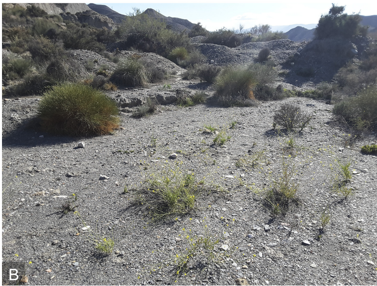
Fig. 2. A: orthophotographic view of the location of the populational nuclei presented here for Gymnocarpos sclerocephalus ; note the aridity of the land-scape and the absence of human activities apart from the highway. – B: habitat of G. sclerocephalus in the rambla of Lanujar (Spain, Almería, 17 Mar 2018).

2020. In the moment of this collection, two nuclei of 28 and 42 individuals were recorded, with 11 more scattered in between, totalling 81 individuals in an area of 2.4 ha. The full collection data of the voucher specimen are as follows: