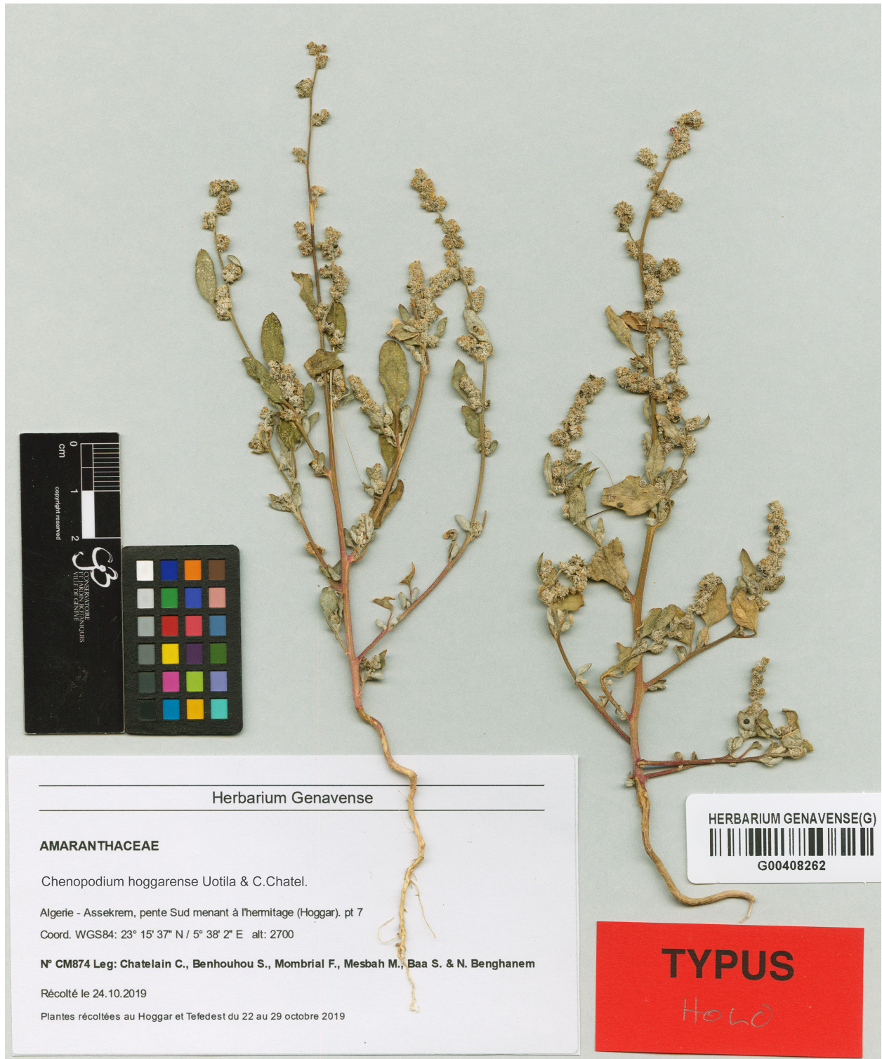
Fig. 1. Holotype of Chenopodium hoggarens (G [G00408262]).

gin entire or with a few obscure teeth, apex acute to mucronate to cuspidate; upper leaves narrowly elliptic to lanceolate (Fig. 3A). Inflorescence occupying most of plant height, composed of paniculately arranged, mostly well-spaced, dense glomerules, mostly leafless in upper 1/3 of stem and branch length, in leaf axils in lower parts. Perianth lobes 5, basally united for 1/4–2/5 of their length,